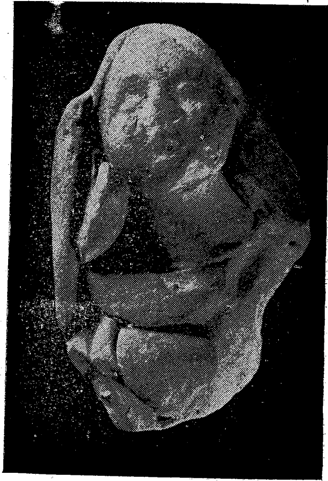
Pre-Maurayan Figurines ?