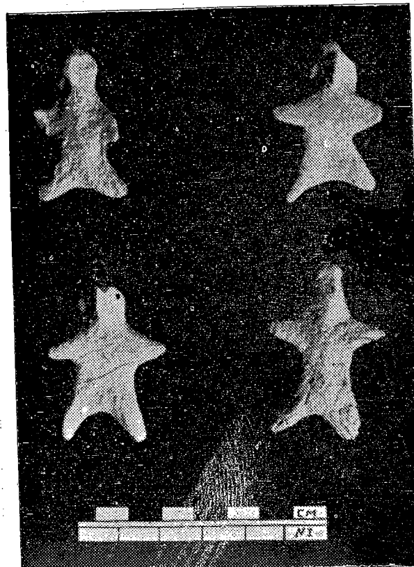
(B) Kushan Figurines Negam Type