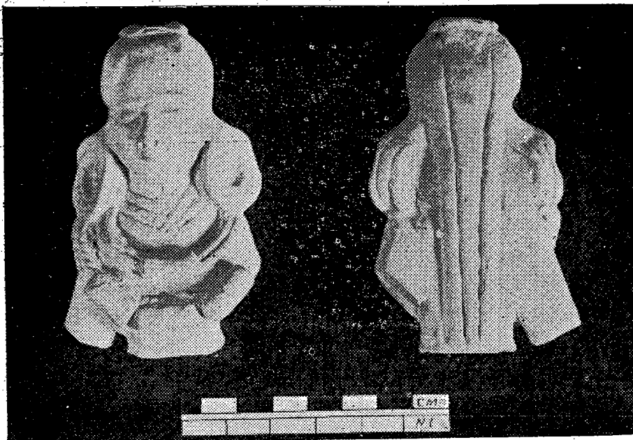
(B) Maurayan Figurine (Ob. 8 Rev.)