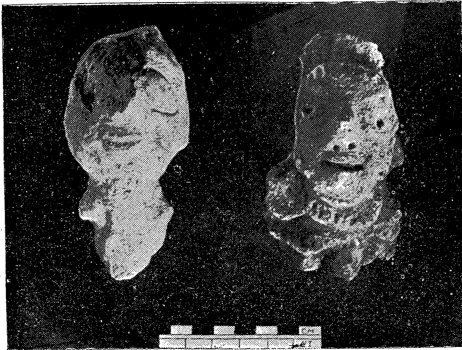
(A) Kushan Figurines