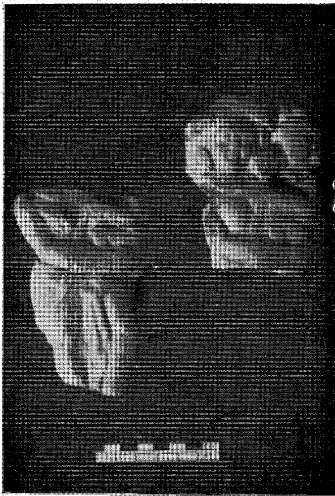
(B) Shunga Figurines