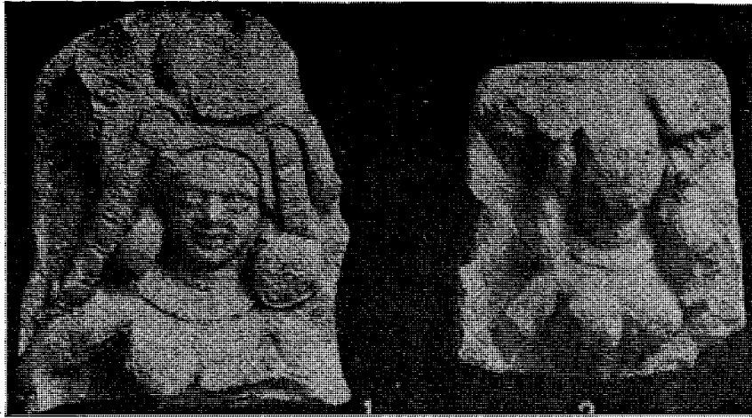
(A) Shunga Figurines