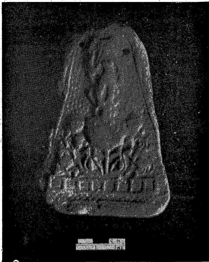
(b) Shunga Plaque