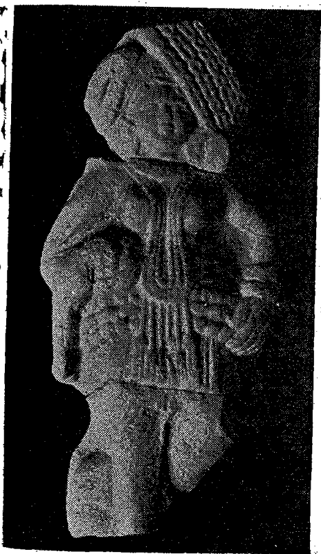
(A) Shunga Figurine