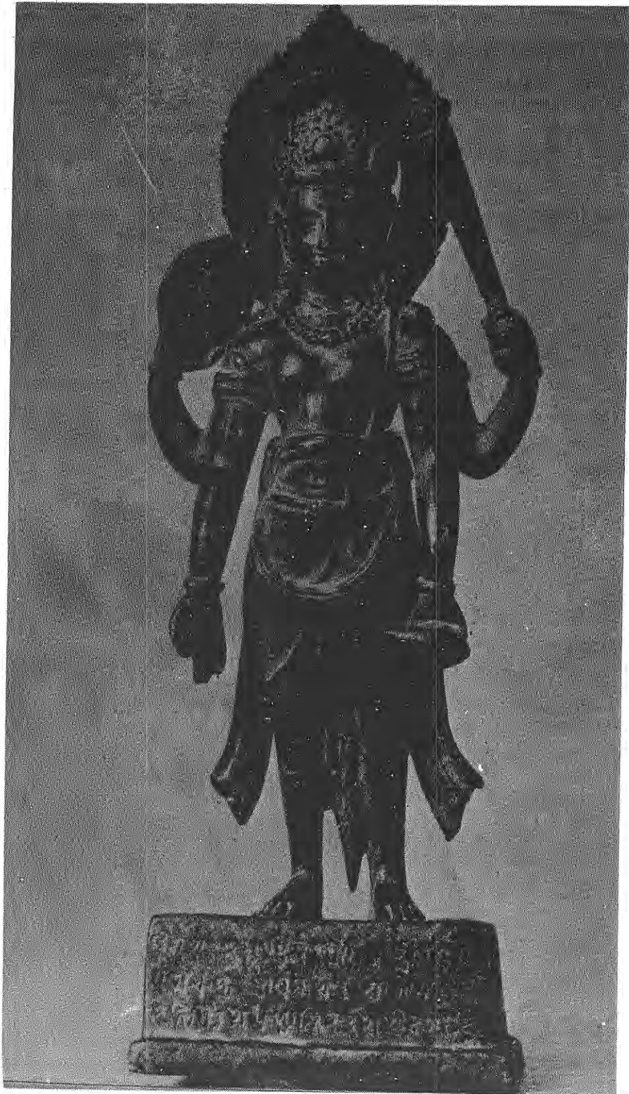
Fig. 2. Viṣṇu, cast copper (?) A.D. 748 (?), approximately 30 cm. present whereabouts unknown.