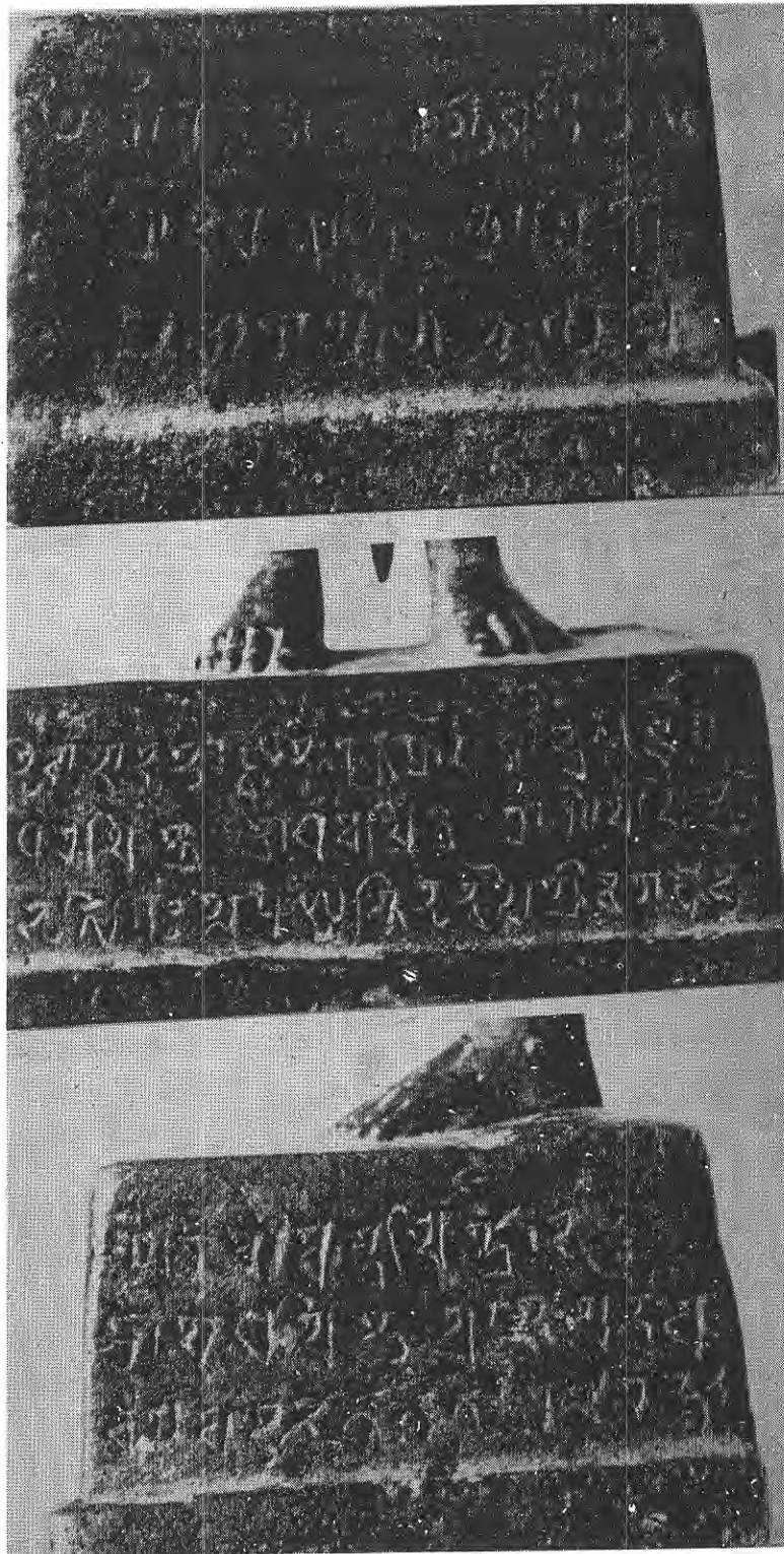
Fig. 5. Detail of Fig. 2, inscription: a) right side of base; b) front of base; c) left side of base.