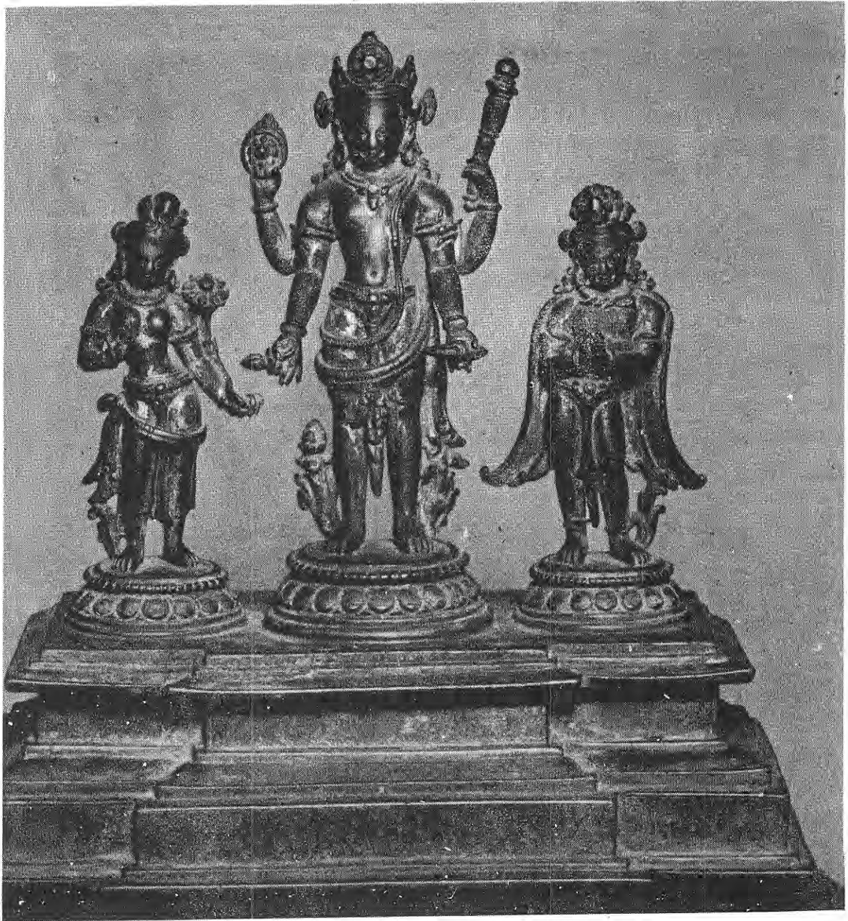
Fig. 6. Lakṣmī-Viṣṇu-Garuḍa triptych, gilt copper, A.D. 1698, H. 22.5 cm., Prince of Wales Museum of Western India, Bombay.