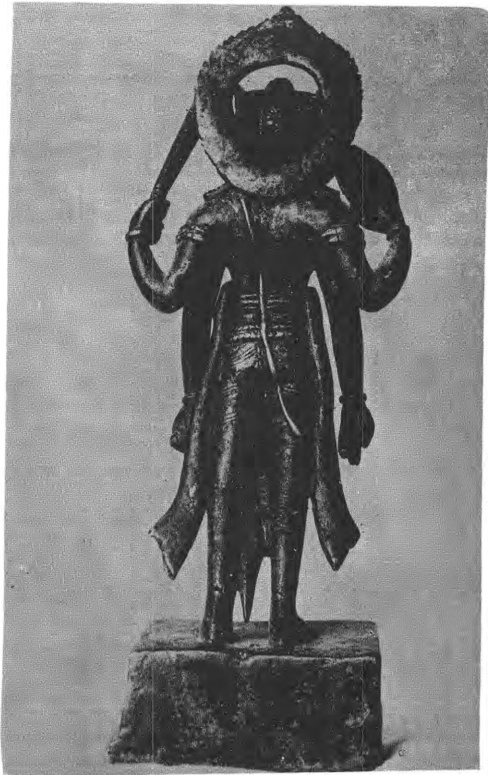
Fig. 3. Detail of Fig. 2, rear view.