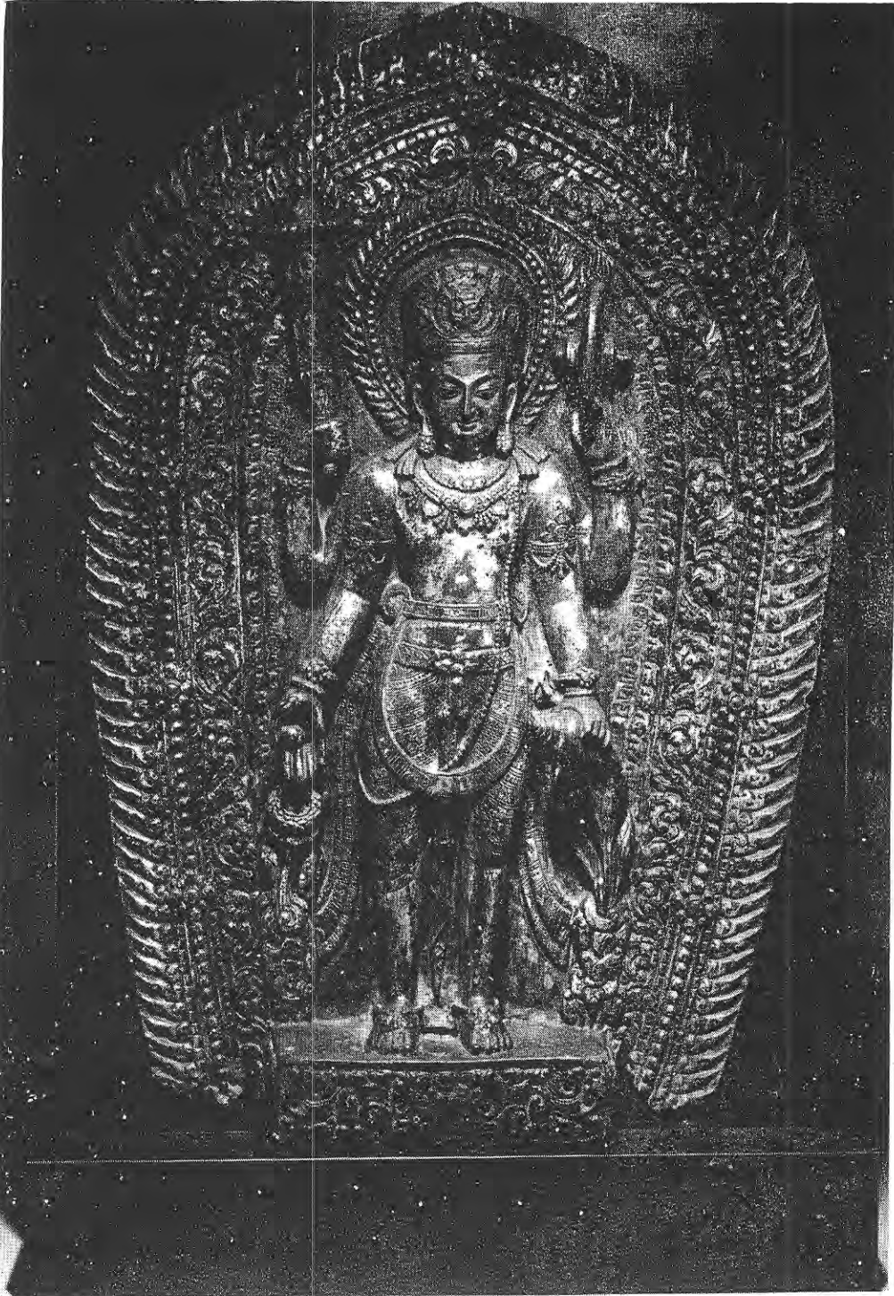
Fig. 1. Standing Viṣṇu (?), gilt copper repoussé, A.D. 983, H. 47 cm., The Los Angeles County Museum of Art (Gift of the Ahmanson Foundation)