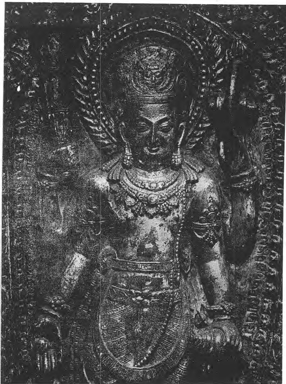
Fig. 1a. Standing Viṣṇu(?), gilt copper repousse, A.D. 983; detail of Fig. 1