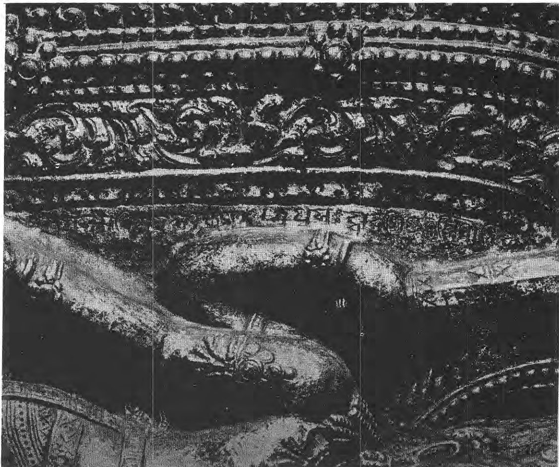
Fig. 4. Detail of Fig. 1, right side of inscription (corresponds to appendix, line 1, inscription no. 1)