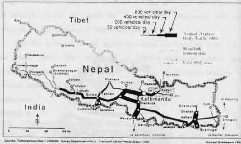
Figure 1: Traffic volumes on Nepal's road network in 1986. Even on the busiest route (Kathmandu - Raxaul), the average daily traffic of 800 vehicles per day looks modest compared to European standards. Road branches such as the one to Jiri, Ilam or Tulsipur are used by less than 50 vehicles per day, often criticised as inadequate usage in comparison to the investments made.

Migration patterns and the transport infrastructure provide the necessary basis for understanding Nepal's situation on the macro level. Out of the transport infrastructure, the road traffic claims far-reaching impacts on the regional organisation that is studied in detail for the area east of Kathmandu up to Jiri.