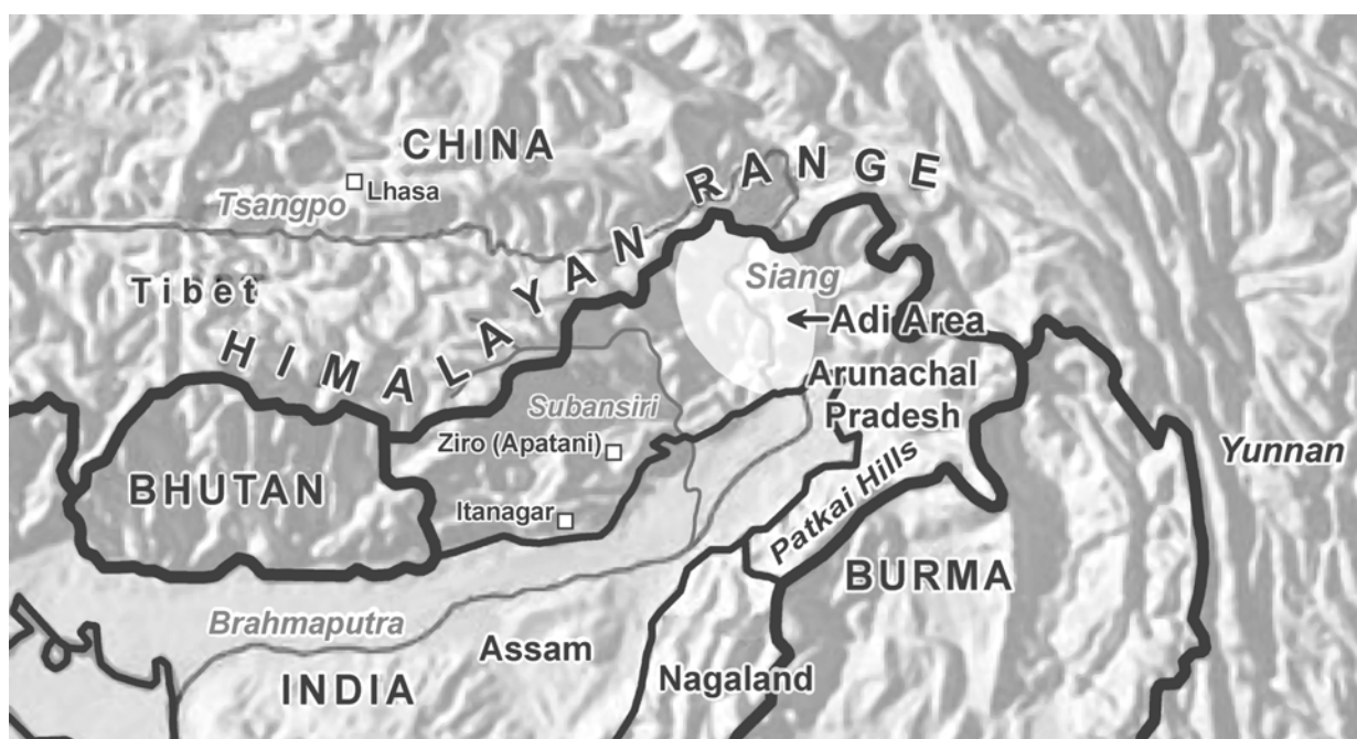
Arunachal Pradesh: Tribal areas

This essay focuses on the tribes of central Arunachal because most of the published translations of migration legends, as well as my own field collection, comes from them; 15 they are also less well-documented in written records than are the migration histories of some of the Buddhist (or buddhicised) tribes. 16 The central group (including Nyishis, Tagins, Hill Miris, Adis, Apatanis; the Mishmis further east are anomalous) is known locally as the "Tani" group", from their common mythical ancestor Abo-Tani, who figures prominently in their oral traditions. Linguistically, too, the Tani languages form a discrete group within the Tibeto-Burman family. 17