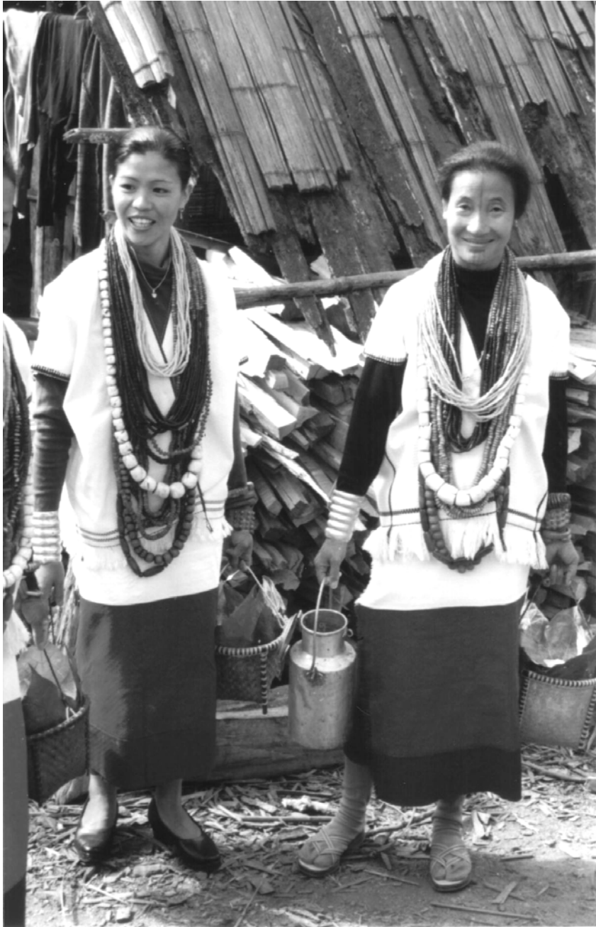
Apatani women in ceremonial dress and beads at a feast, January 2003.

beads began to move from Calcutta up to Nagaland about 1700; and Untrach has documented a brisk trade in beads and other body ornaments between Calcutta and Nagaland in the early nineteenth century.