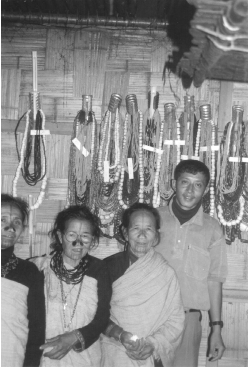
Apatani beads on display inside a feast sponsor's house, January 2003.

The perceived origin of beads determines not only their relative worth but also their use, which has not changed much since the 1940s. 68 Again among Apatanis, beads from the plains are generally worn everyday, as part of a woman's ordinary dress and often in a mixture of small, brightly coloured yellow, blue and red beads ( chamer ); they are part of everyday use, although younger and educated women wear them less and less. "Tibetan beads", including the light blue ones, on the other hand, are reserved for ceremonial wear, at major festivals, feasts and other public occasions. There are no formal rules, but the general practice is that only married women (and widows) wear beads of either type; at the festivals, it is especially the