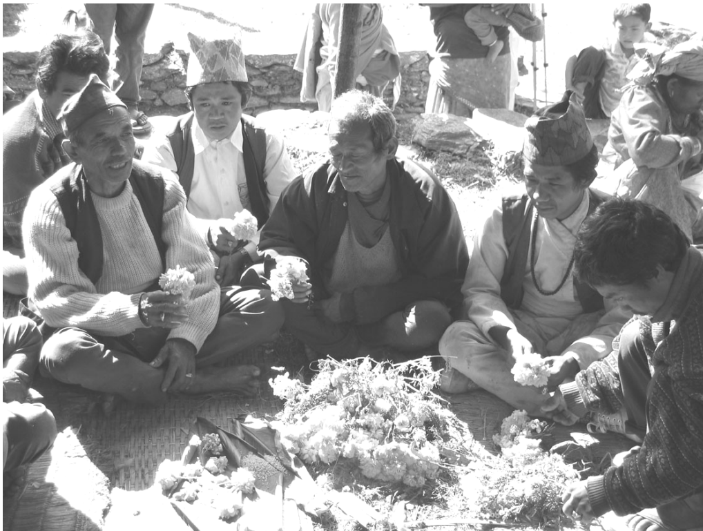
Fig. 1: Thangmi guru propitiating deities at the beginning of Devikot Jatra. Dasain ghar , Dolakha Bazaar, October 2004.