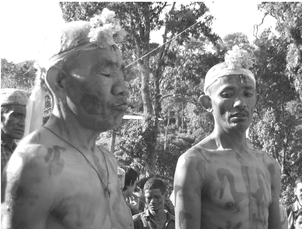
Fig. 2: Thangmi nari anointed with red powder to mark them as demons, shortly before drinking blood. Devikot temple, Dolakha Bazaar, October 2004.