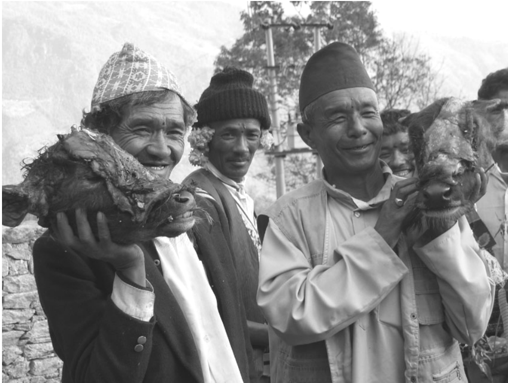
Fig. 3: Thangmi tauke carrying the heads of sacrificed buffaloes during Khadga Jatra. Dolakha Bazaar, October 2004.

carrying Thangmi cut off the tails of the dead buffaloes lying there, and stuff the tails in the mouths of the severed heads. The whole festival concludes after the dancers chant verses to scare the demons into dispersing (fig. 4). The heads are then ritually useless and are dragged along the ground carelessly instead of carried proudly on shoulders. They heads are returned to Devikot, where they will be chopped up into small pieces and given as a ritual offering to the Newar participants.