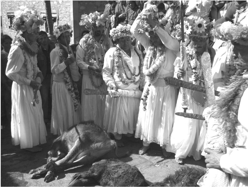
Fig. 4: Newar dancers circling slain buffaloes in front of Rajkuleswar temple during Khadga Jatra. Dolakha Bazaar, October 2004.