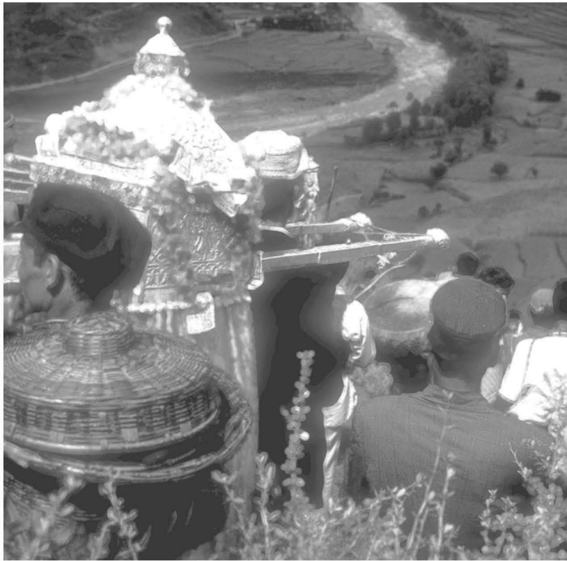
Fig. 4: Roof- or Box-type Palanquin.

is slung, indicates the palanquin's anthropomorphic construction as the martial body of a demon-slaying ruler.