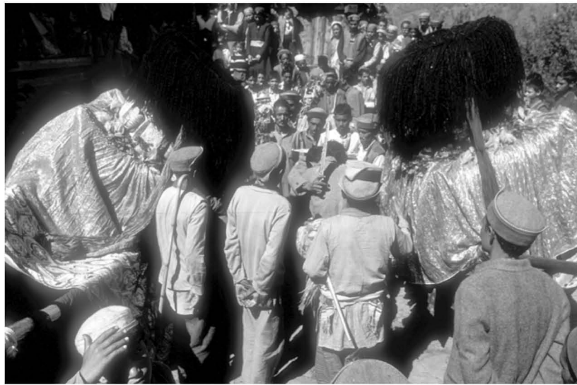
Fig. 7: The ritual t(r)ope of encounter ( milin ).

invited gods are seated around the maṇḍala in an "assembly" ( khumbli ) in positions that are spatially ordered by caste – the pitchers of the Brahman priestly gods to the east; the palanquins of Khash-Rajput royal deities to the south. This gathering of gods around a single female center gives visual and dramatic form to the classic Devīmahātmya narrative of the creation of the goddess Durga's body from the aggregated powers of the thirty-three gods of Indralok (heaven). In a similar trope of gender and number inversion, the twin forms of the Hindu goddess are spatially counterposed to form cosmological horizons, that is to say: the multiple/malevolent Kalis that dwell in the peripheral mountain-top wilderness ( parbat ) are unified and transformed in the singular/benevolent Durga evoked at the settlement center. In this composite female figure of theistic sovereignty formed by the gathering of gods and the transfiguration of the goddess, interlocal political order is metaphorically enacted at Śānt as the pacification of disordering entities from outside ( bahār ) – local Kalis, demons ( rākaṣ ), ghosts ( bhūt-pret ) and forest-powers ( janḡalī śaktis ).