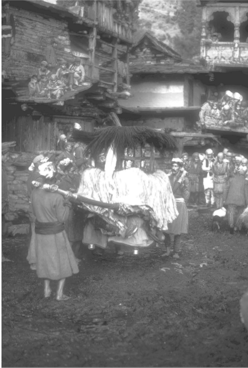
Fig. 6: Jabali Narayan Dances.