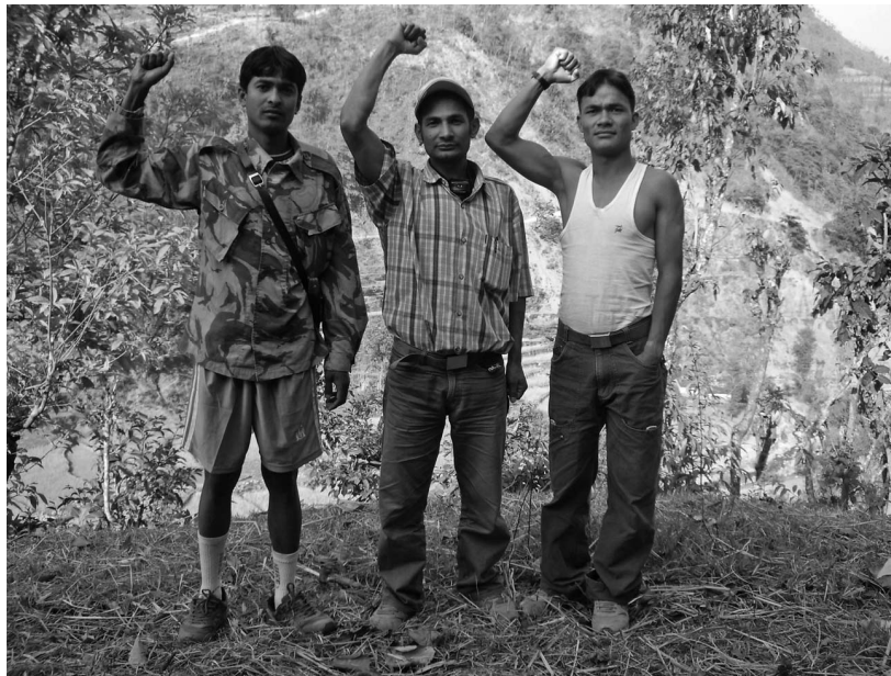
Maoists in Bijuli, Pyuthan district, Feb. 2006.

Yet, one must not believe that the CPN (Maoist) was totally absent from Pyuthan. The north of the district came to be one of their strongholds during the war, an area which they used as a corridor to mobilize their army for their attack on Sandhikharka (in Arghakhanchi) in September 2002 or on Tansen (Palpa district) in January 2006.