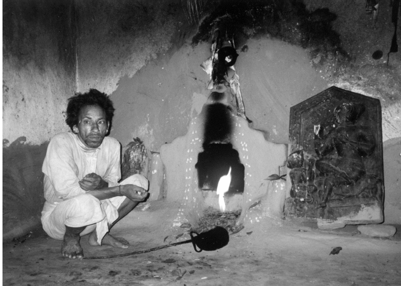
The priest from Sirasthan showing the sacred flame, Dullu, April 2003, photo: M. Lecomte-Tilouine.

Shyam's narrative is a parallel, "funny People's War" versus revolutionary methods and authoritative rules. In the way he describes how the retaliation was led in Dullu, we are presented with recalcitrant and uneducated villagers using witticism, provocative music and spirit possession as weapons, along with "snubbing" tactics, in order to put up resistance against inflexible rulers determined to forcibly implement a social and cultural revolution.