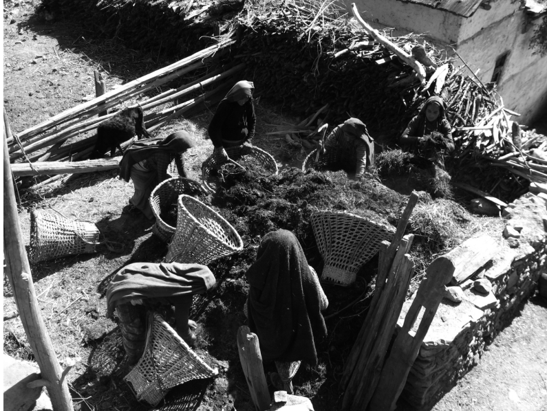
Women carrying porso , animal manure mixed with pine needles. Jumla, 2007.

him engaged in political activities leaving all the household and agriculture work, including carrying manure, to his wife.