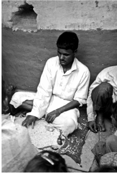
The Dhami of the Dullu royal lineage, April 2000.

days. Then they cut the long lock of hair of the dhami of the Masta of Pali. 194