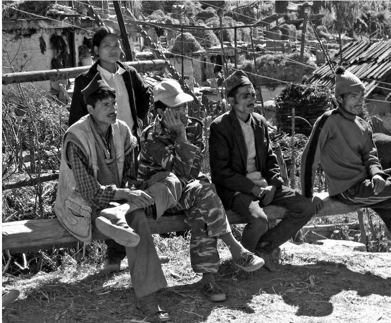
A PLA woman with her village comrades during a period of leave, Jumla, 2007.