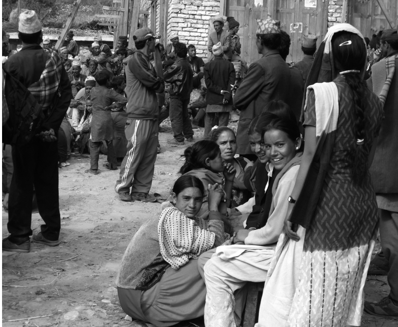
Young Maoist women at a Maoist meeting in Jumla Bazar, 2007.

replace the deserter. In the case of a refusal, the family has to pay a hefty fine. Despite the threat of punishment, some men left not only the Party but also the village (if the person stays in the village after leaving the Party, he will be taken back to the Party either to reintegrate it or to be punished). Some deserters came back to the village after the Maoists had signed the peace agreement with the Government; nevertheless, these returnees are being courted by the Maoist cadres to bring them back to the Party.