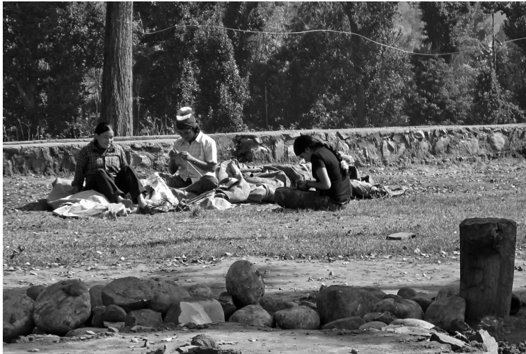
PLA women knitting in a PLA cantonment, 6 th division, Dasarathpur, Surkhet, 2007.

The Maoist rhetoric on the emancipation of women by ending all forms of exploitation of women and sex discrimination and guaranteeing them gender equality remains rhetoric, at least in the Sinja Valley.