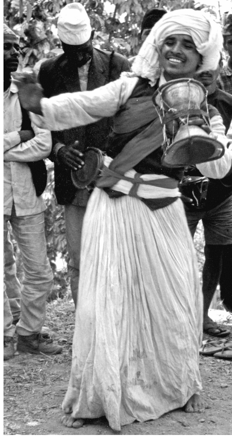
A Hudke Damai bard performing in Dullu, April 2000