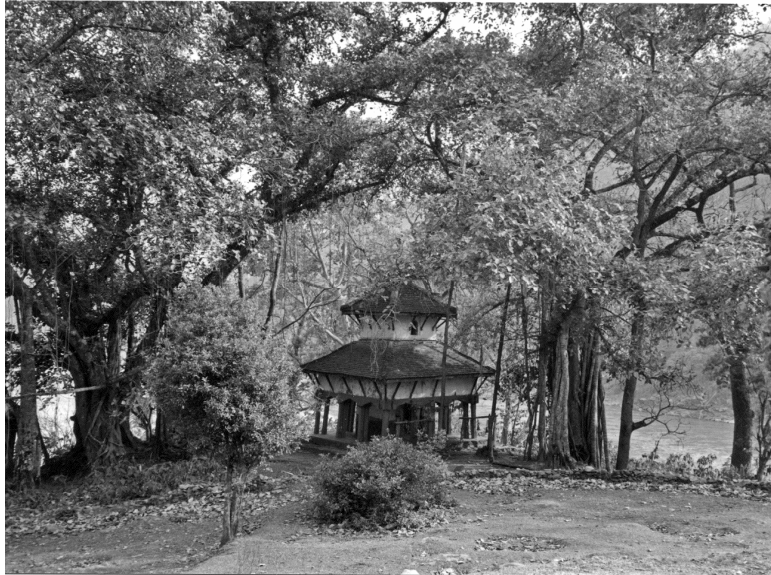
The temple of Dungeshwar in 2003, opened by 'the people'.