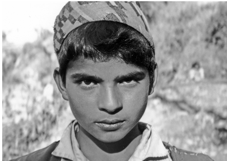
A Dulal boy, Dullu, April 2000

A collective reaction, such as the one witnessed in Dullu, was not reported elsewhere in the Nepalese hills during the revolutionary decade. 185 Despite its uniqueness, I became personally interested in the subject for having resided in Dullu for four weeks in 2000 and for two weeks in 2003 for my ethno-historical research. This fieldwork had already proved to me that Dullu was indeed a special place. It had formed a major political centre for almost a millennium, successively housing the capital of the Malla Empire (1100-1400) and the capital of the Kingdom of Dullu (1400-1960). It is also the centre of a religious ensemble known as the Panchakoshi, where several eternal gas flames burn in temples. These two features are essential, and the Dulals, as the inhabitants of Dullu are called, clearly express their feeling of belonging to a distinct territory, which they depict as rich and holy: they qualify Dullu as a priceless land ( amulya jagga ), and as a meritorious ground ( punya bhumi ). This qualification is shared by their neighbours, who, in addition, view the Dulals as special people, in particular for being fairer and more beautiful than others, but also for being endowed with satya , truth, virtue.