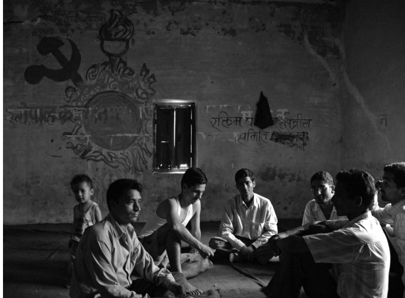
Rastriya Mukti Morcha, Butwal, 2007