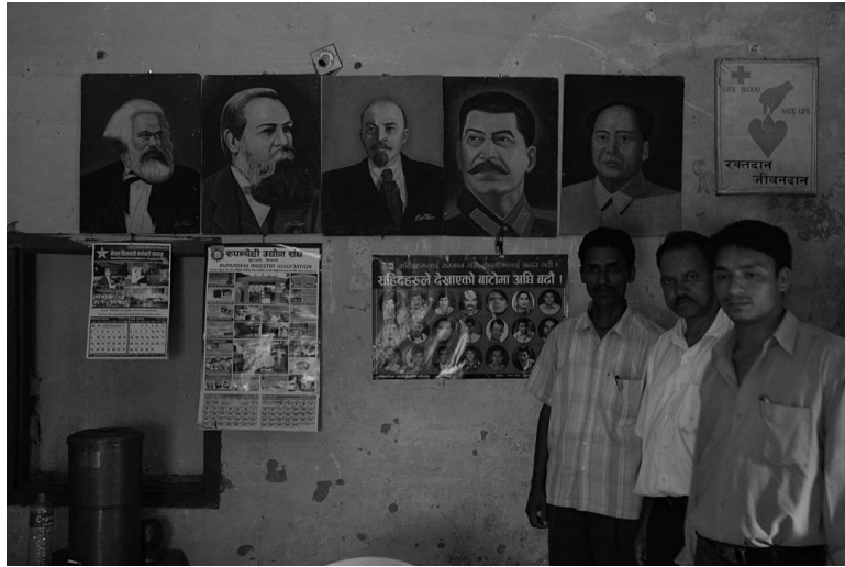
The Rastriya Jana Morcha office in Butwal, 2007