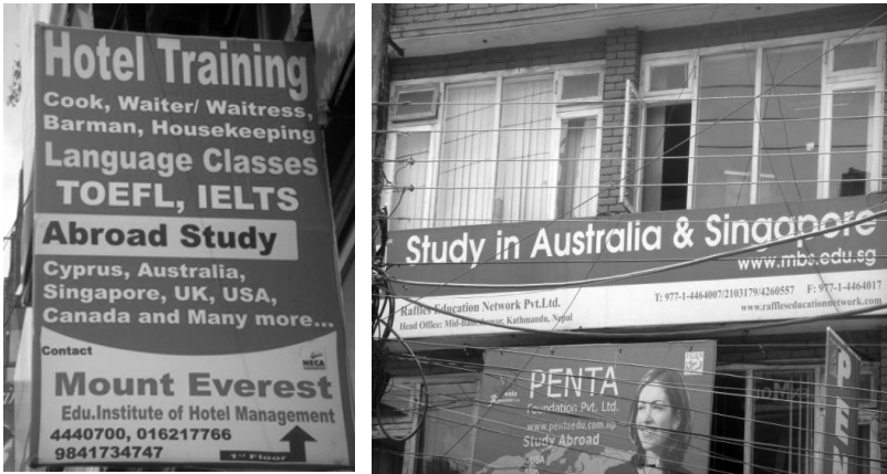
Plate 1: An example of the hundreds of posters that encourage Nepali students to go abroad to study in Singapore.