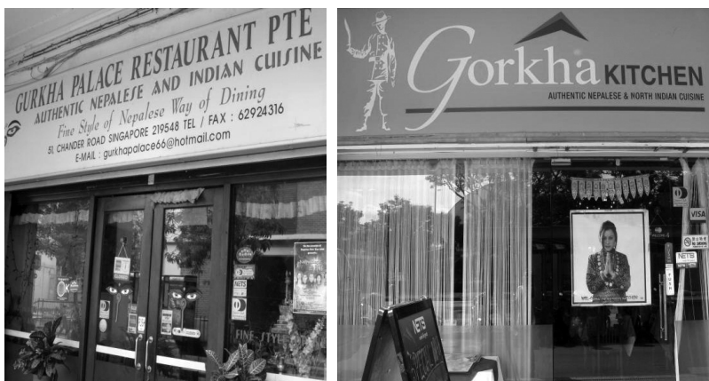
Plate 2: 2011. Nepali Restaurants in Singapore.

At the turn of the century, as the Maoist insurgency continued to disrupt the country, educational prospects in Nepal were bleak. It therefore became imperative for Nepali students to go abroad and it was during this period that hundreds of posters and advertisements produced by private educational agencies mushroomed across Kathmandu, capitalising on students' desire to go abroad to countries like the United Kingdom, the United States of America, Australia, Singapore, and Cyprus. These posters encouraged prospective students to pursue further studies, especially in the field of hotel management and hospitality, or to work as waiters and chefs in restaurants.