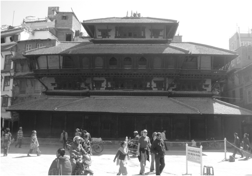
Fig. 1: Kavīndrapur Temple, locally known as Nāsadyah Temple

However, even with this new translation it does not become clear precisely which sacred place the chronicle is referring to. This only happens if we carefully analyse the topographical and local situation. Then it becomes evident that the chronicler is speaking about the previously four-tiered building at the end of the Kathmandu Darbar Square, which is