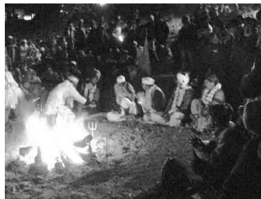
Plates 2a-2b-2c-2d: Jāgara of Jiyā Rānī in action (Uttarāyaṇa annual fair), possessed persons and devotees from Mukteshwar (District Nainital, Pl-2a, night of January 13, 2012), and Salt area (District Almora, Pls-2b, night of January 13, 2012; 2c and 2d, night of January 13, 2013) in Kumaon. Note the female figures representing Jiyā Rānī.