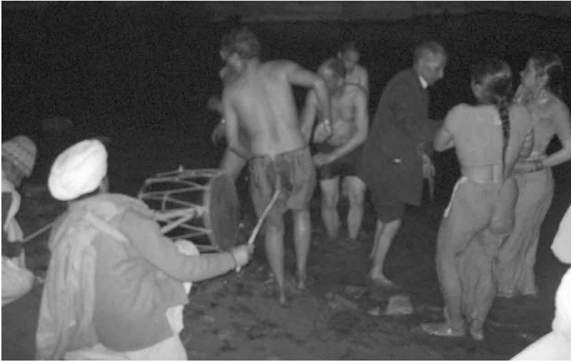
Plate 6: Devotees from Garhwal (including persons possessed by the Katyūrī spirits) taking a ritual bath in the Gaula, marking the commencement of the Jāgara of Jiyā Rānī on the eve of the Ranibagh Uttarāyaṇa annual fair (night of January 13, 2014).