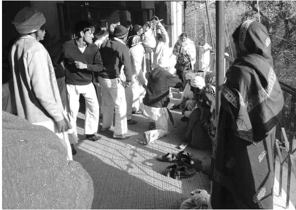
Plate 1: Spirits of the deified Katyūrī kings offering their salutation to the jagari (folklore singer belonging to the Śūdra community) in the course of the Jāgara of Maulā/ Jiyā Rānī in front of the temple of Jiyā Rānī at Ranibagh (District Nainital, Uttarāyaṇa annual fair, morning of January 14, 2012).