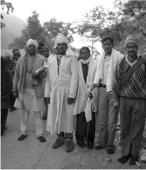
Plate 4: Devotees from Dhumakot (District Pauri, Garhwal). The second one from the left is dressed in traditional Katyūri upper garments. To his right is the folklore singer and to the left the female medium of Jiyā Rānī (Ranibagh Uttarāyaṇa annual fair, morning of January 14, 2013).