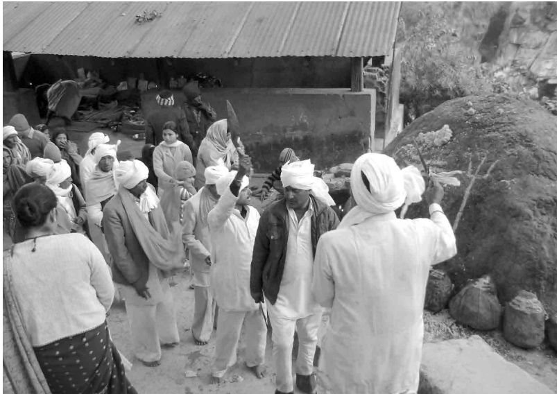
Plates 3a-3b: Night procession of the devotees after a ritual bath, with folklore singers from Mushiyakhan (District Pauri, Garhwal, Pl-3a, January 13, 2012); procession being led by persons possessed by the Katyūri spirits waving daggers – the Katyūri attribute (Ranibagh Uttarāyaṇa annual fair, morning of January 14, 2013).