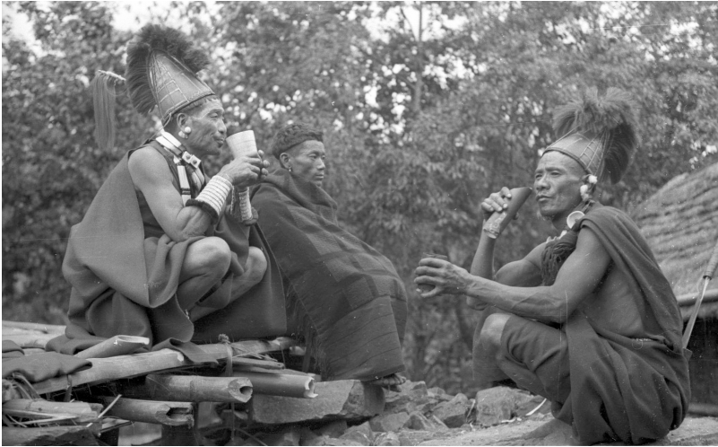
Photograph 1: Yimchunger Naga drinking beer. Image taken in Kuthurr village by Christopher Von Furer-Haimendorf (1937). Source: SOAS Furer-Haimendorf Digital Archives (JICS), PPMS19_6_NAGA_1070.

to give these areas a common exotic identity as a repository of Naga material culture and as unexplored Naga tribes rich in tradition, customs, ritual practices and body art (tattoo) that produced their identity as people of another time, who were more primitive and traditional than their administered neighbours where missionary evangelism and the colonial modernisation had led to marked changes in native life. Their aim was to ‘rescue-record’ (Lotha 2007: 42-45) their culture by documenting, making still images and collecting Naga artifacts, both as personal mementos and for museums, so as to reconstruct their culture through exhibitions and displays in the colonial metropolis.