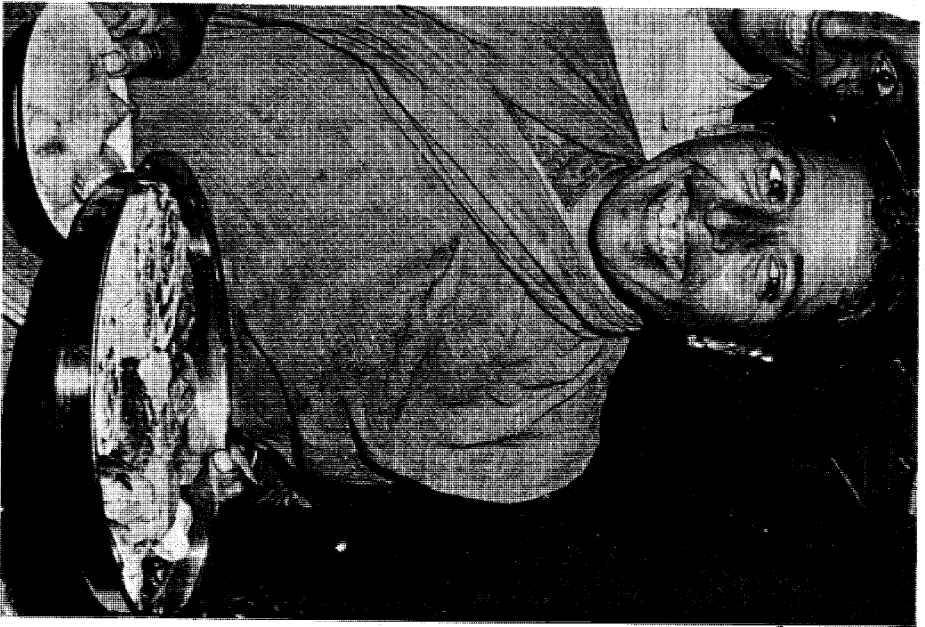
3. A Brahman woman prepares to indulge in the dar Khame feast on the eve of Tij.