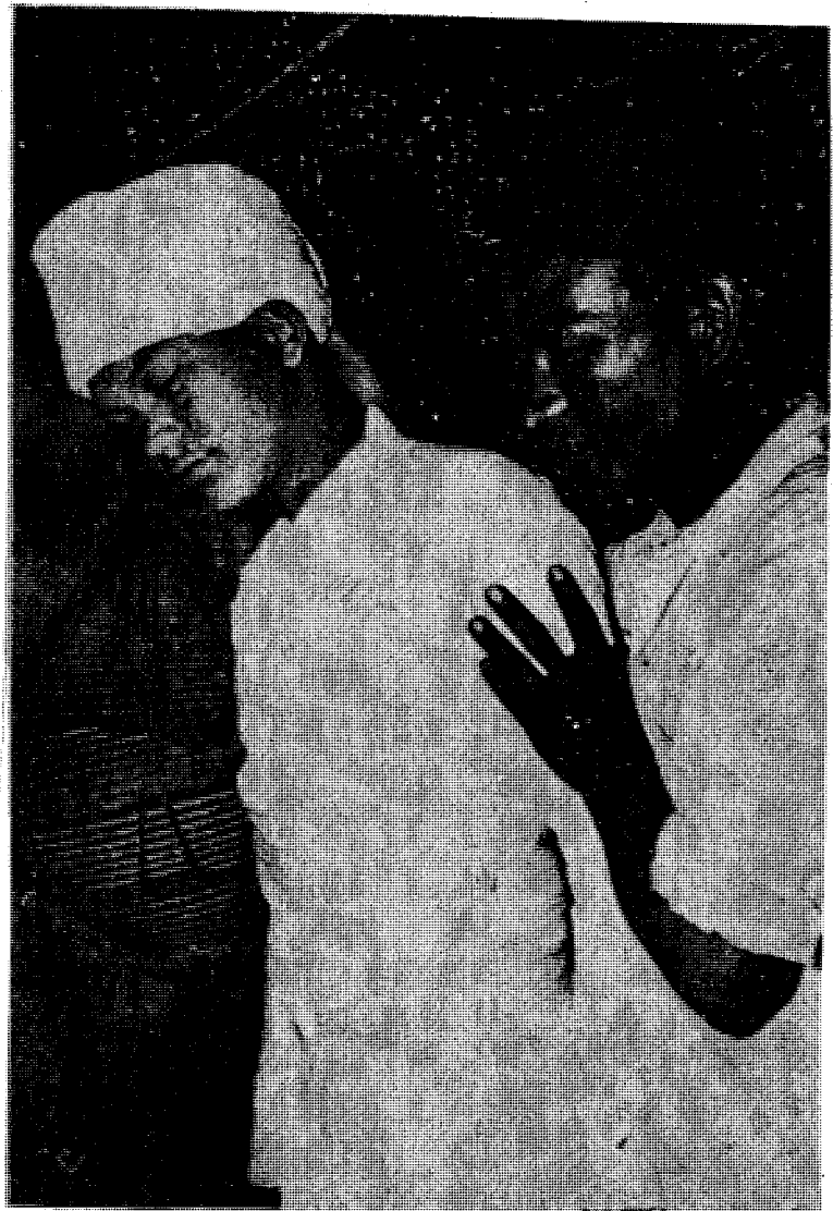
4. The Groom, Assisted by a guruwa , begs for Blessings from the Deities before going to the Bride's House