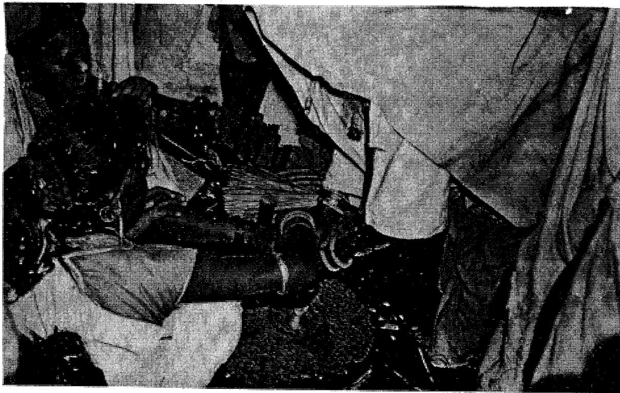
1. Splitting of diuli (black gram) for the Marriage Ceremony