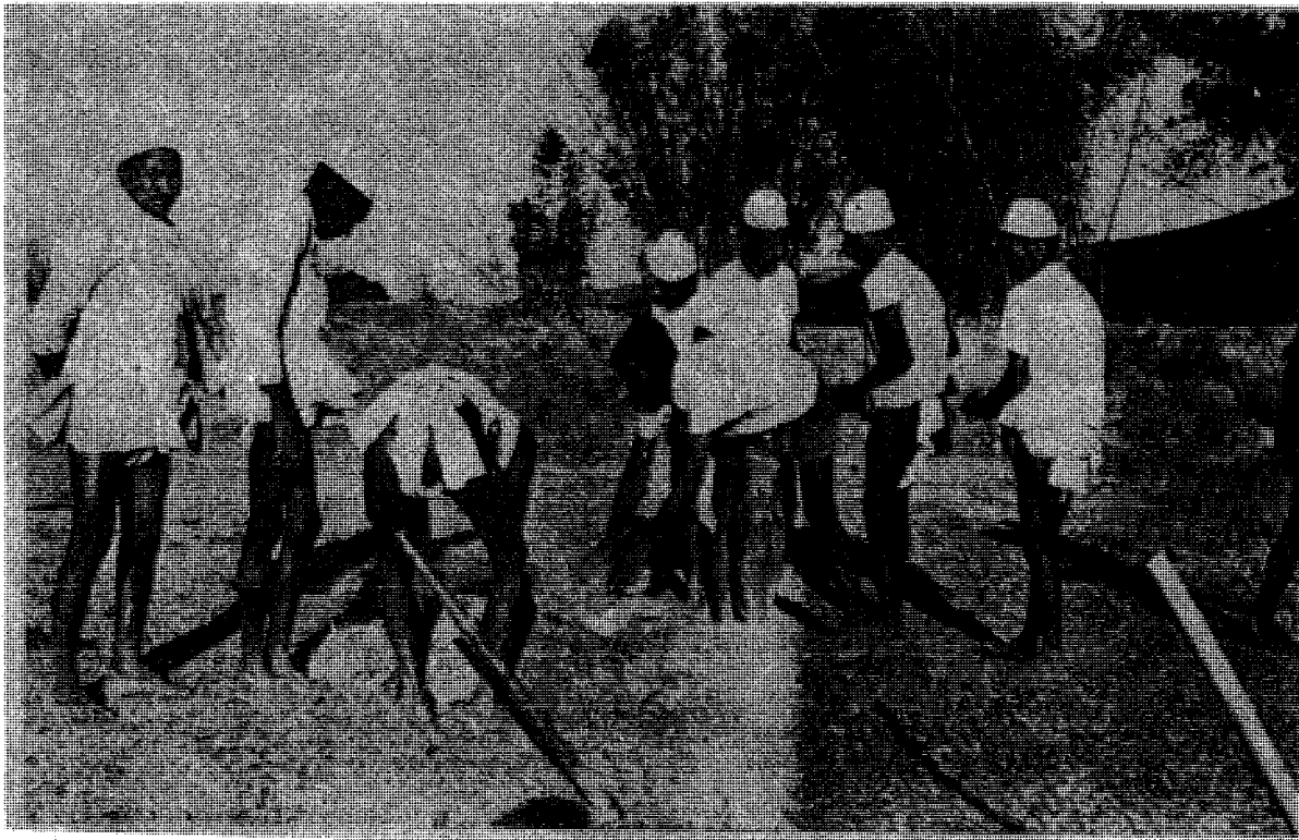
11. Covering the Grave with Earth