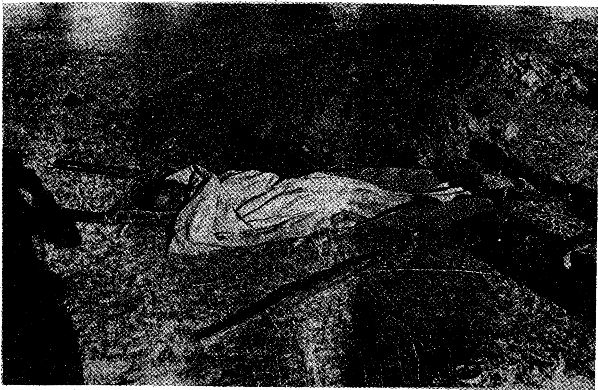
10. Corpse inside the Grave