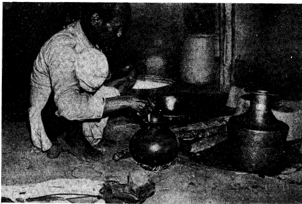
2. A guruwa Purifying the Musgard Oil for Cooking the Holy Dishes of cuni and barrya