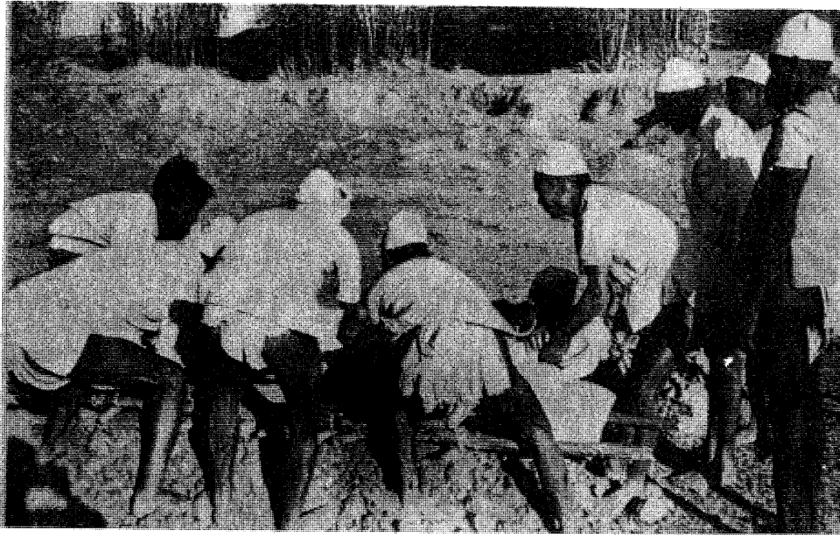
9. Lowering a Corpse into the Grave