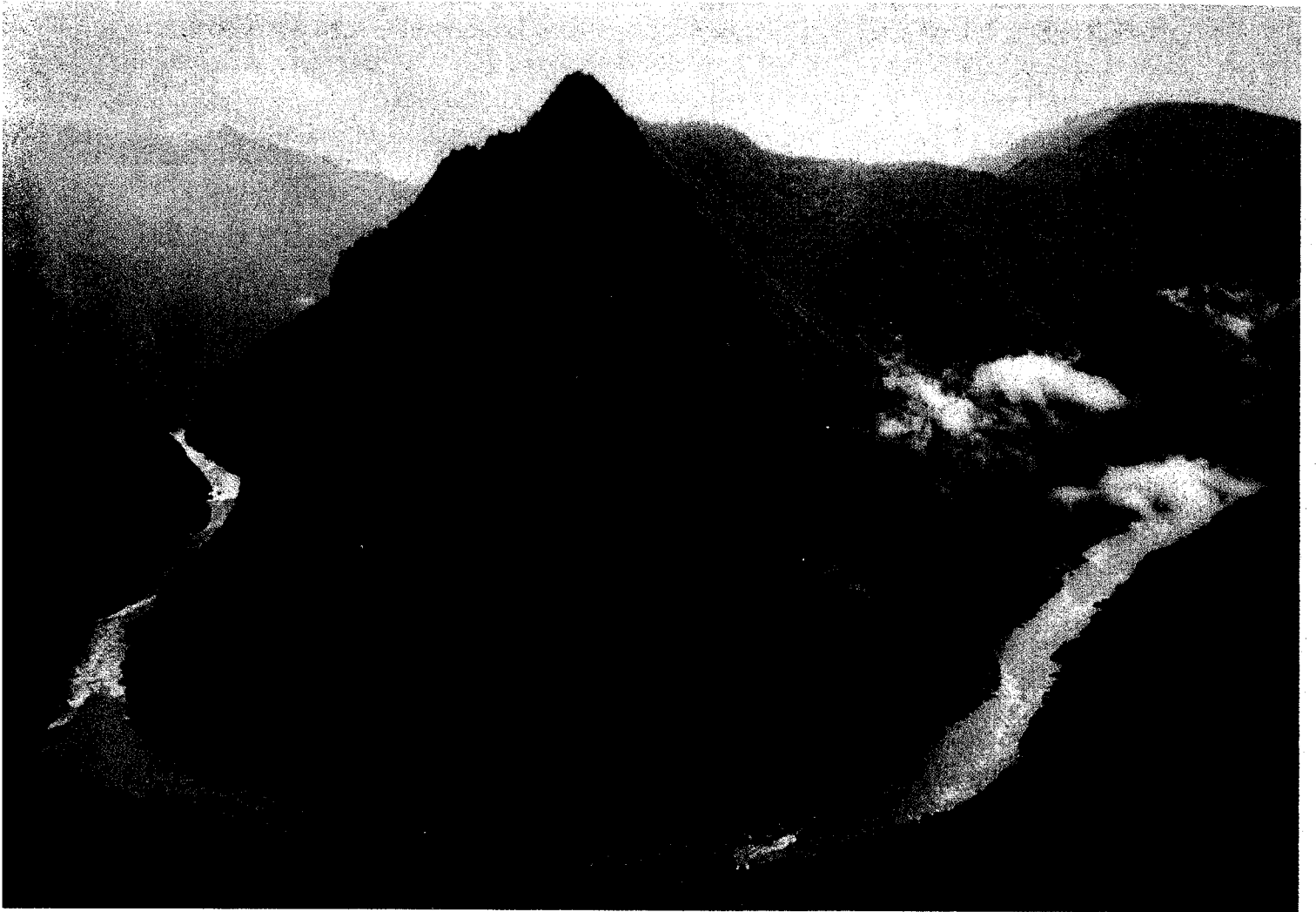
The great bend of the tsangpo River (View from Zachu/Pemako).