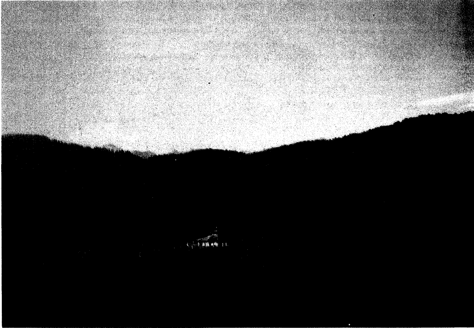
Rinchenpung Gompa, Pemako.