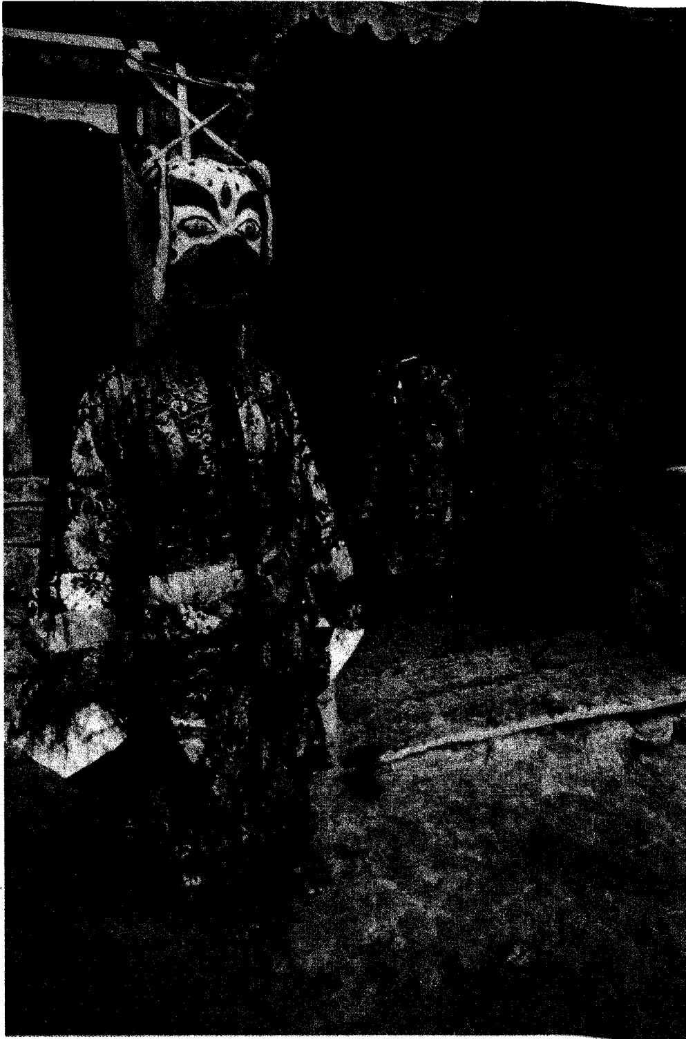
Cham dancer wearing Khyung (garuda) mask.