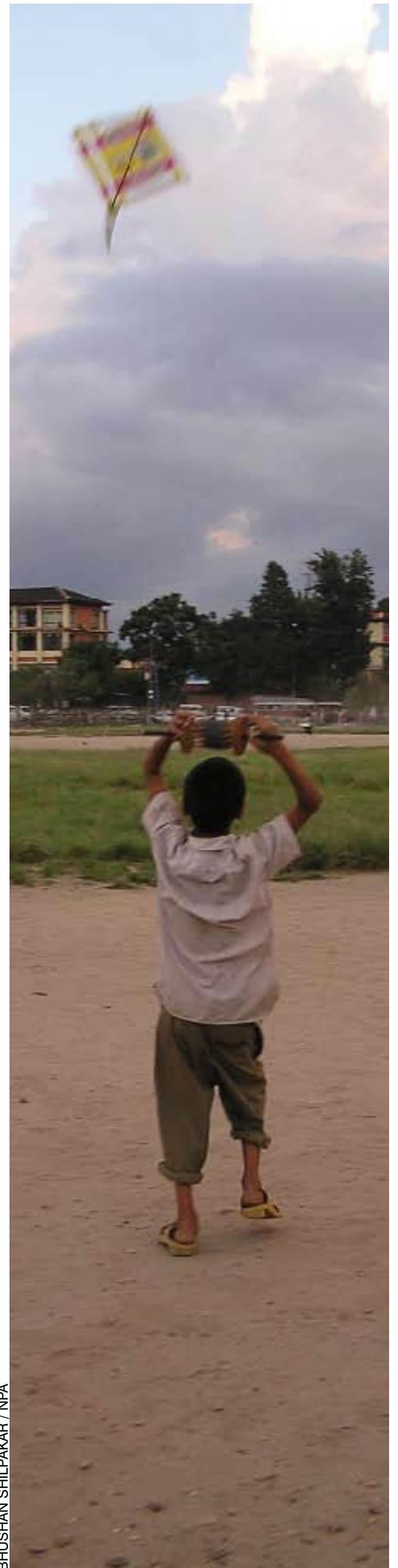
BHUSHAN SHILPAKAR / NPA

More Info: Free Buffet and discounted beverages, International environmentalist and community members performing Nepali cultural shows