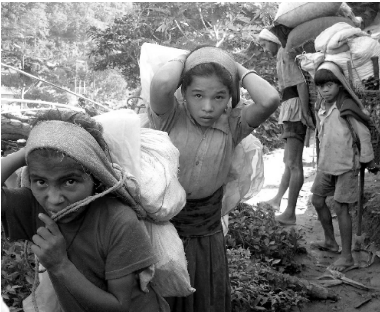
ANUSHIL SHRESTHA / NPA