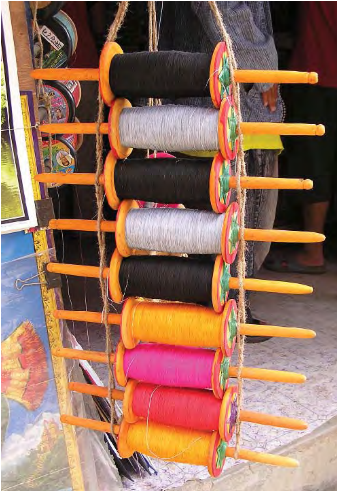
BHUSHAN SHILPAKAR / NPA