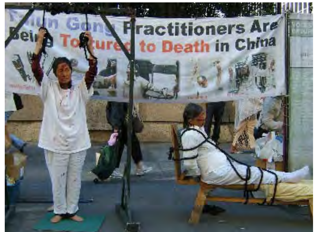
Clockwise from top left: Changanas for sale in Kathmandu for Dasain and Tihar, Lattais for sale in Kathmandu for Dasain and Tihar, Falung Gong practitioners demonstrate against torture in China, Tibetan woman walks outside Madison Square in New York City