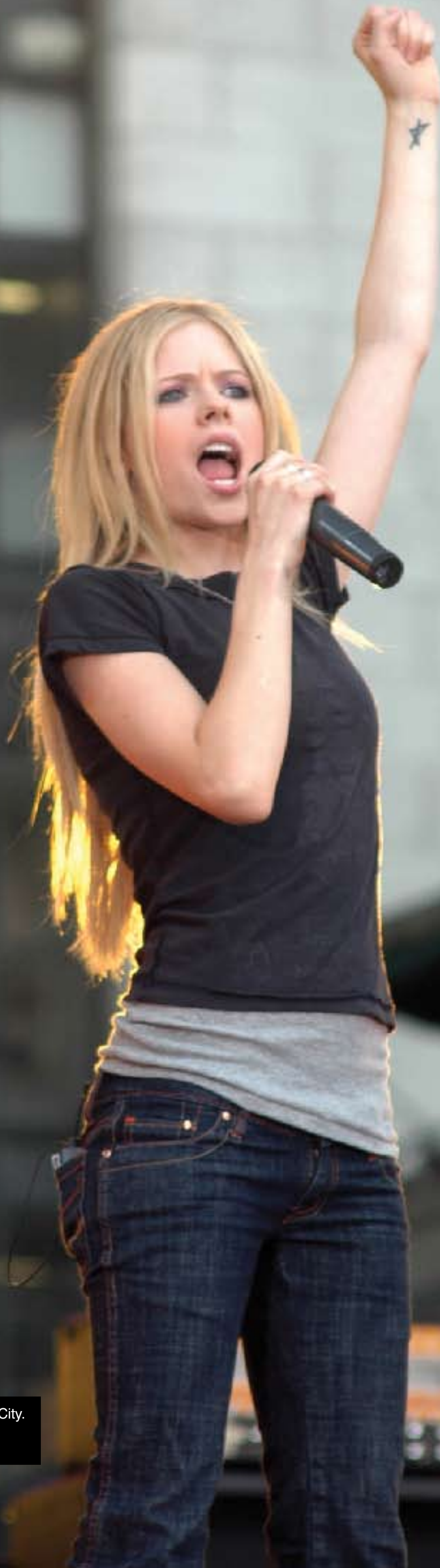
Avril Lavigne performs at Bryant Park, New York City.