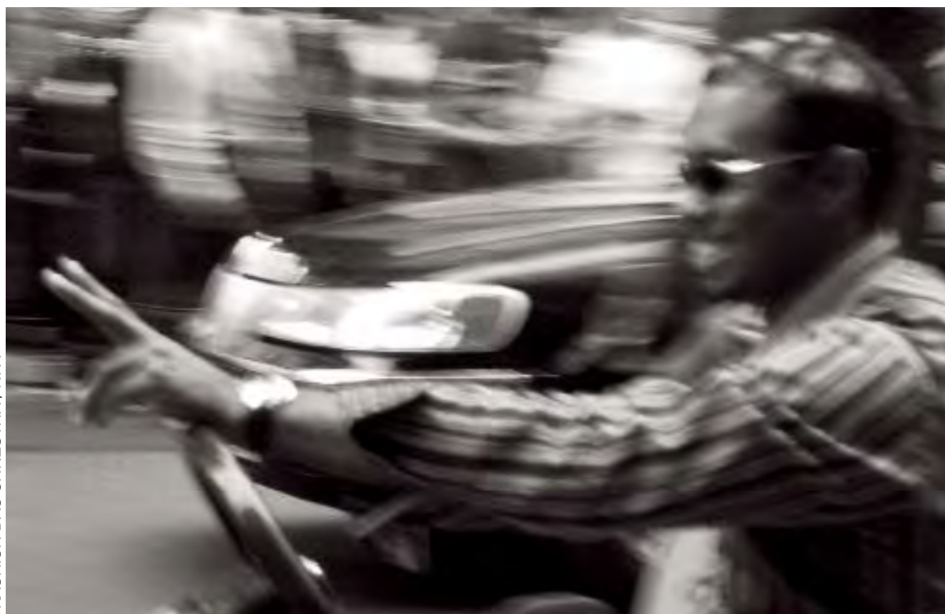
Golf star Tiger Woods rides a golf cart while promoting a new EA PGA Golf video game at Times Square, NYC.