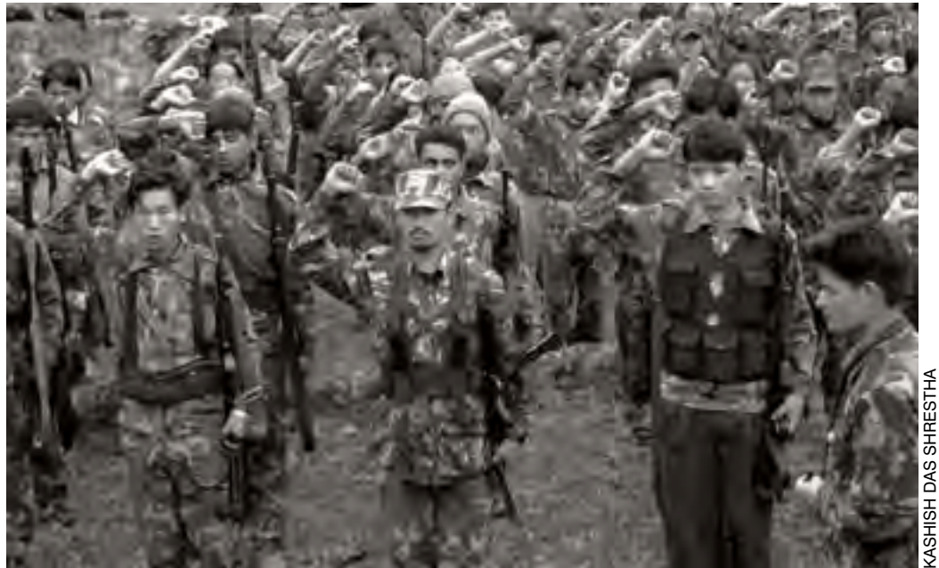
Royal Nepali Army patrols the streets of Dharan, Easter Nepal; Right: People's Liberation Army (Maoists) photographed in the hills of Eastern Nepal, Spring 2005

विराम होला भन्ने आशा गरेका जनतामा निराशा कायमै रहेको स्थितिमा पूर्वी क्षेत्रमा सुरक्षा फौजले गरेका कारवाही चर्चामा आएको छ ।