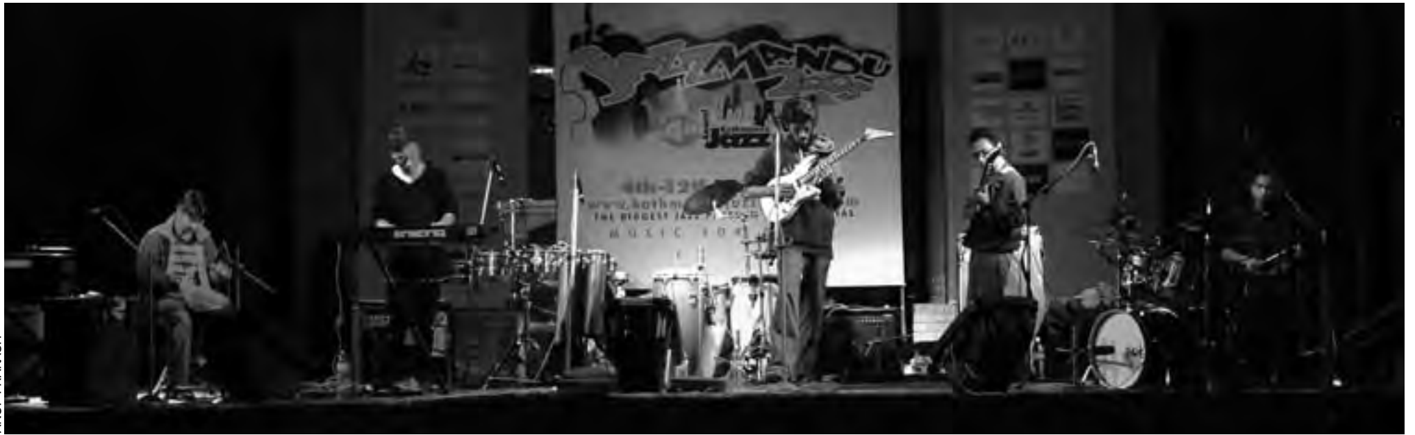
Karmavalanche, this year's winner of the Jazz for the Next Generation contest.