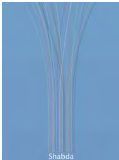
The cover of the first issue of Shabda.

Initiated in 2005 by three young Nepali-Canadian women from Toronto, Shabda - which literally translates to "word" in English - is to be the first youth magazine of its kind in Canada. The magazine aims to promote intellectual activism amongst Nepali youth by giving them a platform to explore their creative, critical, and socio-political sides in writing. The magazine will be launched on January 14 th, 2006 at the University of Toronto. During the event, some of the writers will read their articles and discuss their inspiration for writing it. A short video capturing the vision and making of Shabda will also be screened. The final event of the evening will be a dance party. The $10 entrance fee will give you access to the event as well as a copy of the first issue of Shabda. The magazine will be sold for $7 in newsstands.