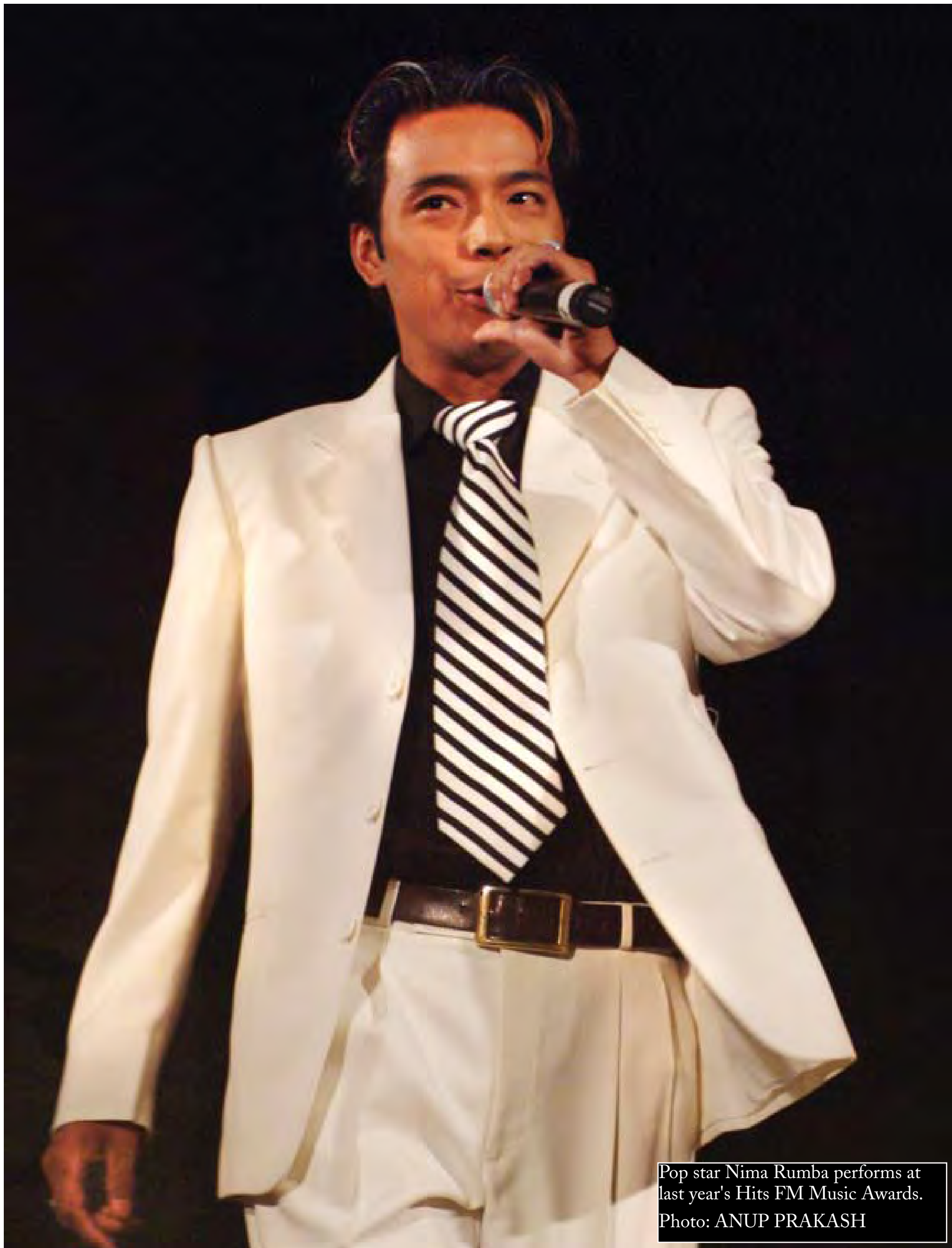
Pop star Nima Rumba performs at last year's Hits FM Music Awards.