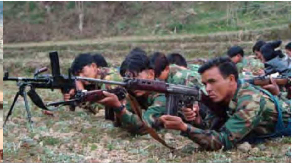
Left: Central Kathmandu and the parade ground. Right: Maoists have said they will march into Kathmandu should the King play foul with political parties and civil society.