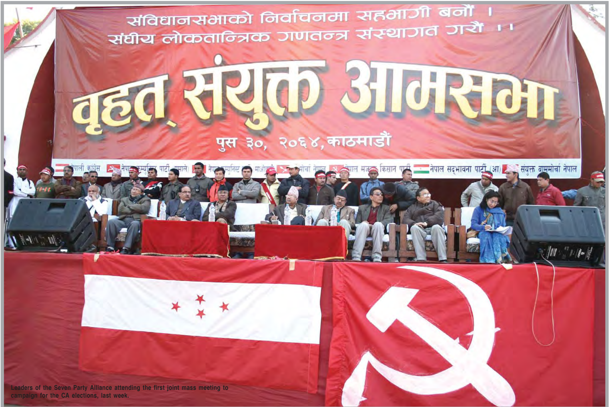
Leaders of the Seven Party Alliance attending the first joint mass meeting to campaign for the CA elections, last week.