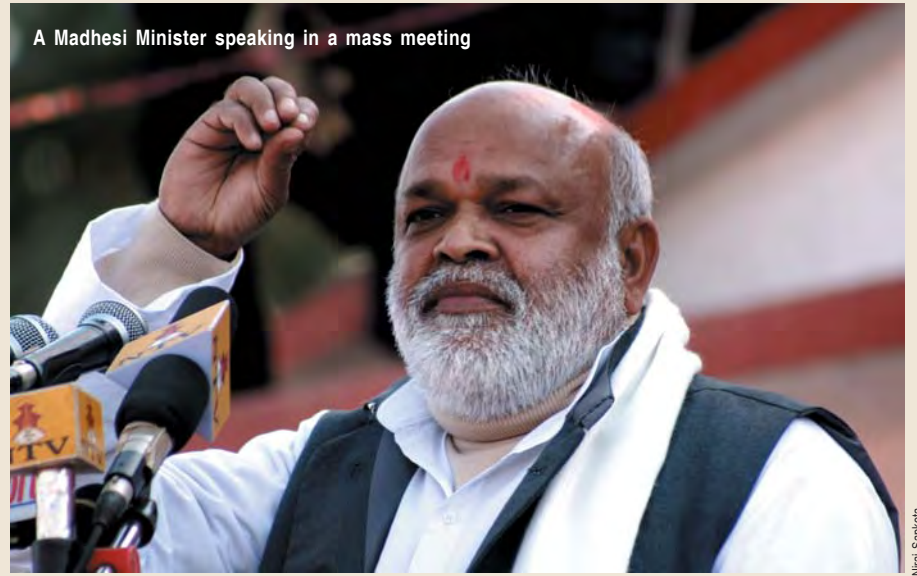
A Madhesi Minister speaking in a mass meeting

Patriarchy exists both in Terai and Pahad; but at a time when Terai is going through the identity crisis and creating a new political environment in the country, it is extremely important to create a political space for women as well. In this sense Terai has a historical opportunity to recognise women leadership and give priority to women's issues, which could be a lesson for the entire national politics. ■