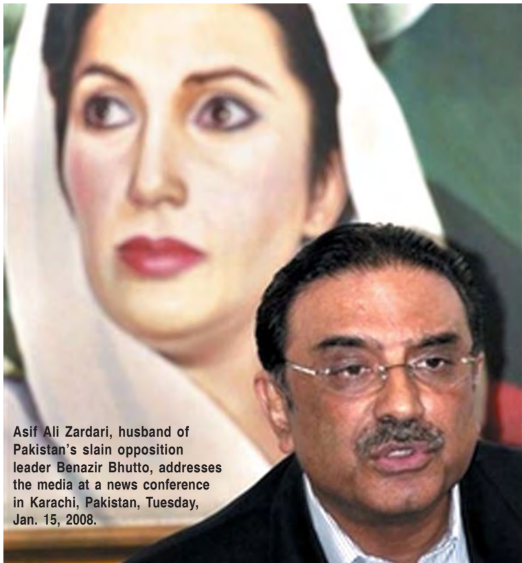
Asif Ali Zardari, husband of Pakistan's slain opposition leader Benazir Bhutto, addresses the media at a news conference in Karachi, Pakistan, Tuesday, Jan. 15, 2008.