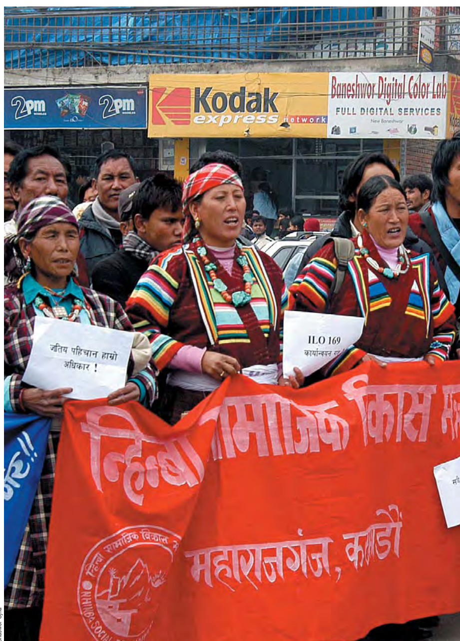
People from different indigenous groups staging a sit-in programme in front of BICC in Kathmandu on Thursday, urging the government to add 48 more nationalities on the current list which includes 59 indigenous groups.

Kathmandu | 21-27 Jan, 2008 | # 50 | Price Rs. 25