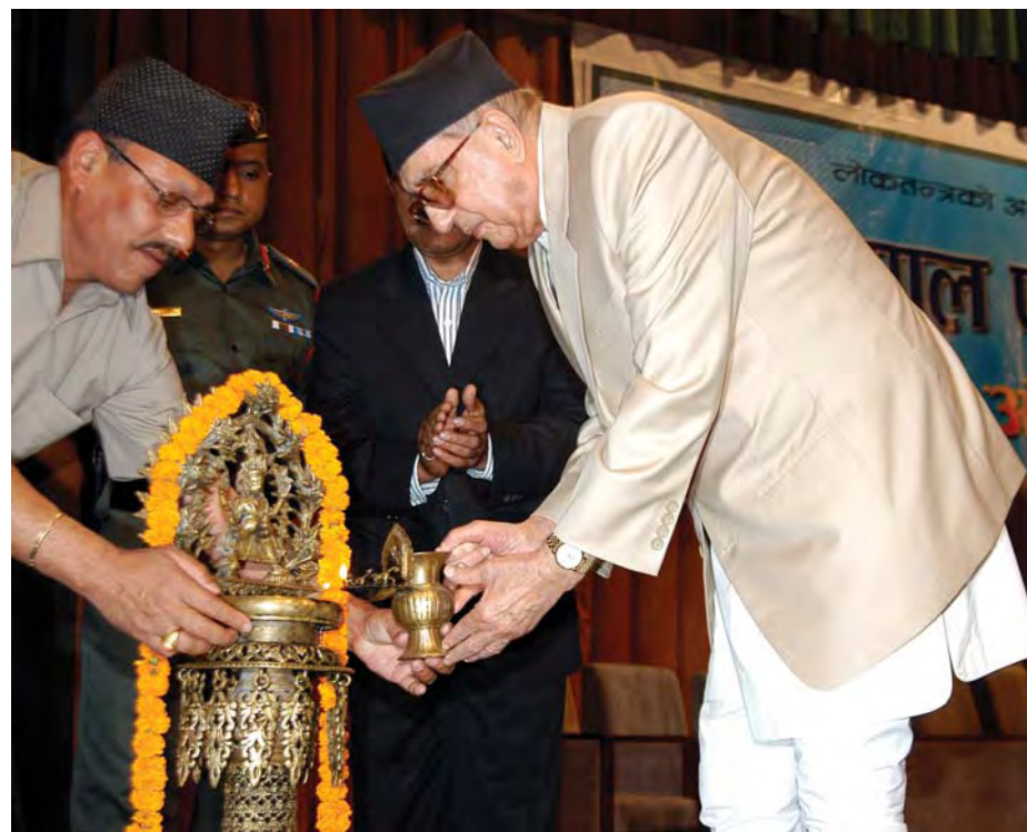
PM Koirala inaugurating the 22 nd General Convention of Federation of Nepali Journalists (FNJ) held at BICC, on Saturday.

The PMO source said that all these issues have been brought out during Koirala's meeting with diplomats; and he will be taking up the issue with all the parties including Maoists, UML and Madheshi Janadhikar forum and other parties in the CA, to arrive at a common agenda. But he has not yet broached on the subject of forming the new government and that will be done as per the provision of the constitution, the source said. ■