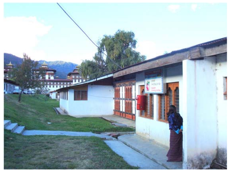
The Tashichho-Dzong post office in Thimphu

In this 2008 picture, the Tashichho-Dzong post office in Thimphu is at the right, while the dzong after which it is named can be seen at a distance. Tashichho Dzong is the center of the Bhutan government, with for instance offices for the king and the prime minister, while it houses