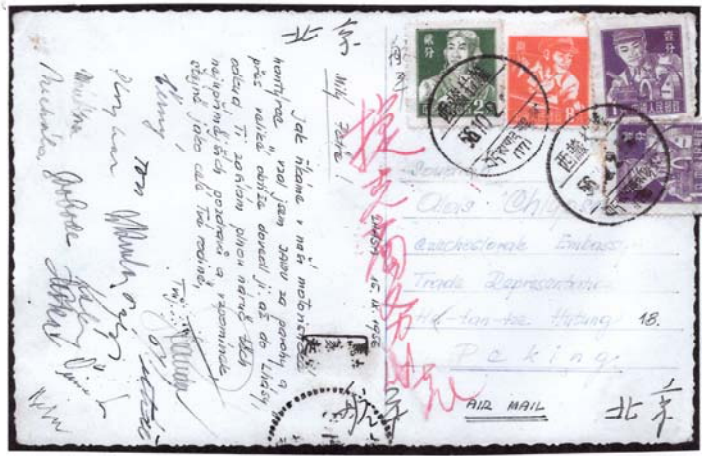
Fig. 2: 1956 Postcard of encampment in Tibet. Mailed from Lhasa October 1956 addressed to Czecholslovak Embassy Trade Representation, Peking, China