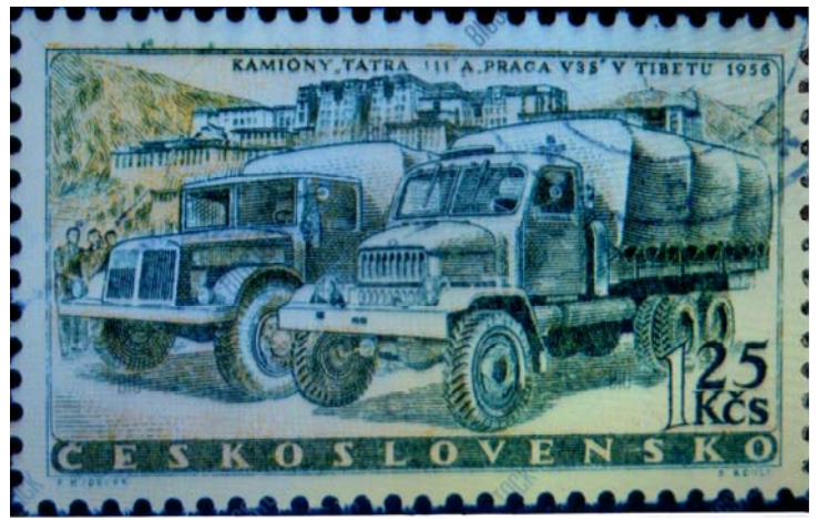
Fig. 1: Enlargement of 1958 Czechoslovakia stamp with Czech trucks at Lhasa, Tibet in 1956

In 1958 Czechoslovakia issued six postage stamps to commemorate the Czech Motor Industry. The highest value, 1.25 koruna, depicts two Czech built Kamiony Tatra III and Praga VS 3 motor lorries in front of the Potala Place, Lhasa, Tibet in 1956 (Fig. 1). How could this have come about?