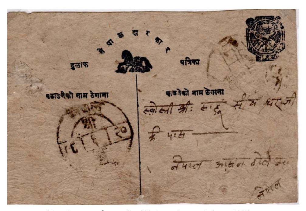
Used copy of van der Wateren's postal card 23b sent from Amlekganj to Kathmandu, October, 1931.