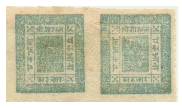
Fig.1: One Anna greenish blue circa 1897