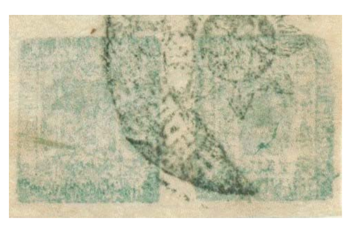
Fig.3: One Anna pale emerald shade recut. Cliché 64 on right inverted. Early one Anna recut as cliché 64 shows minimal damage.