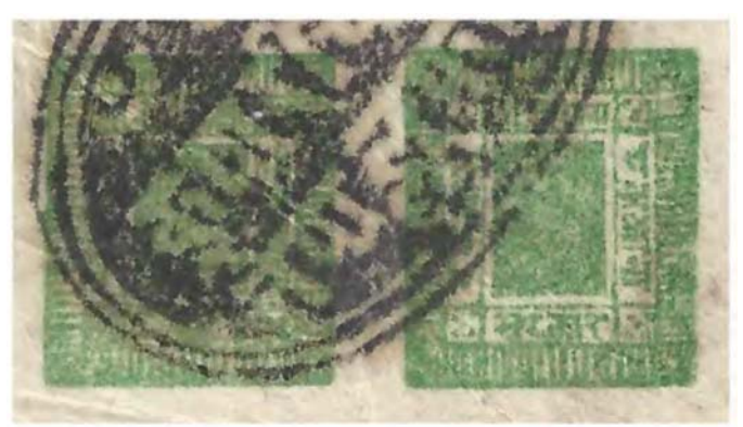
Fig. 4: One Anna recut printed in emerald green similar to the color used for the 4 Anna stamps printed during the later telegraph period.