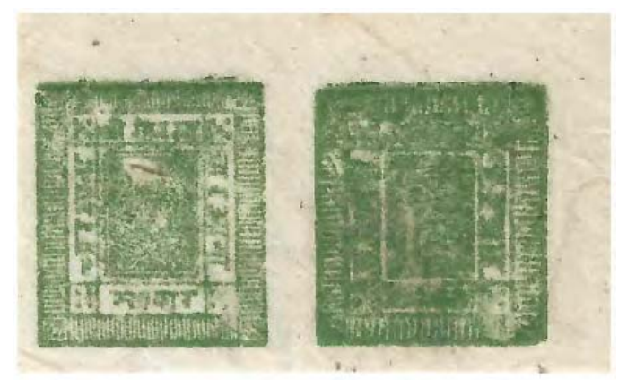
Fig. 2: One Anna recut used in a 4 Anna sheet. The recut stamp on the right is inverted compared to the other clichés.

During the telegraph period, the volume of sheets printed increased dramatically. There is a tremendous variation of shade for the two Anna issues. The one Anna stamps vary in shade from light blue to a very dark blue.