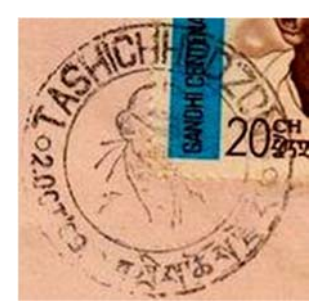
1969 Gandhi FDC

In this 2008 picture, the Tashichho-Dzong post office in Thimphu is at the right, while the dzong after which it is named can be seen at a distance. Tashichho Dzong is the center of the Bhutan government, with for instance offices for the king and the prime minister, while it houses