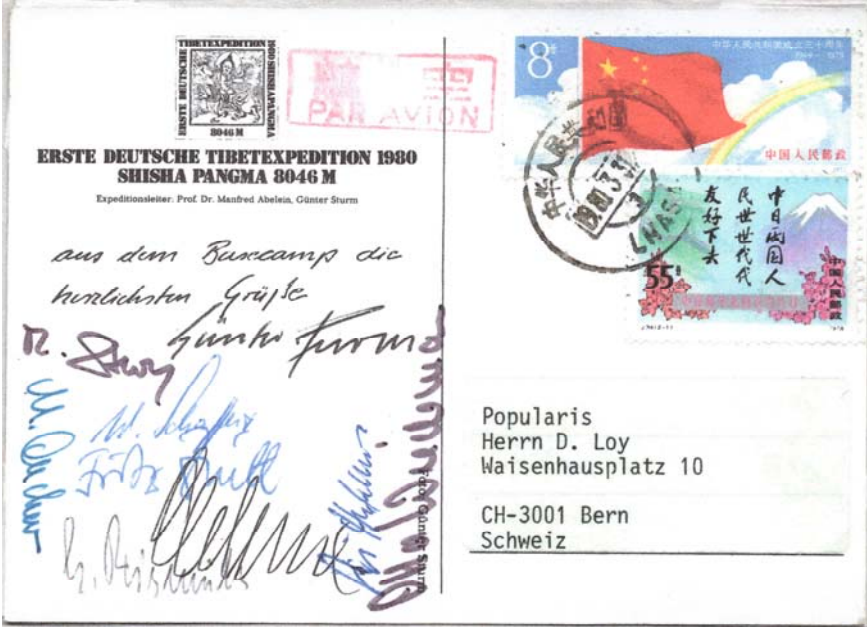
Fig. 2: Back of postcard from the Second Ascent of Shishapangma, showing signatures of expedition member 7 May 1980.

The 1980 Second Ascent was by a strong German Expedition led by Michael Dacher. The summit was reached on 7 May 1980 by the Northern Route. The Expedition Post card was signed at Base Camp by Dacher, Gunter