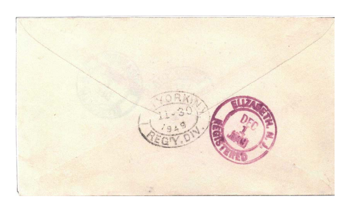
Fig. 2: Back of cover with receival marks from New York, NY and Elizabeth, New Jersey, 1 December 1949.

For those Tibet collectors with Wolfgang Hellrigl's "Postal Markings of Tibet" (Geoffrey Flack, 1996) please amend the date in table on page 13.