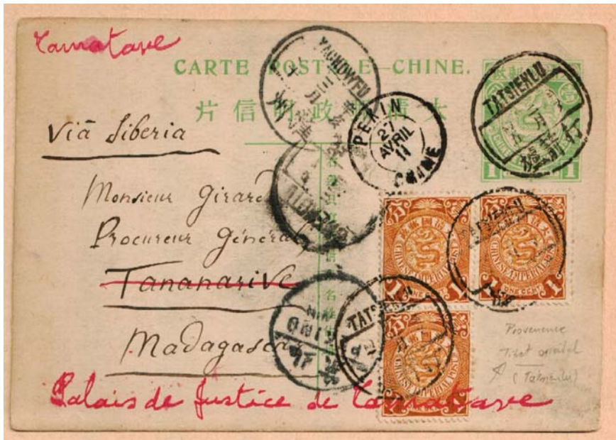
Fig. 1: Postal card sent from Tatsienlu to Tananarive, Madagascar, 1911

- From the bank of Yalong - 29 March (manuscipt on the back) - TATSIENLU departure: 3rd month, seemingly 5th day: 03 April 1911 - YACHOWFU transit: 3rd month, seemingly 10th day: 08 April 1911 - CHENGTU