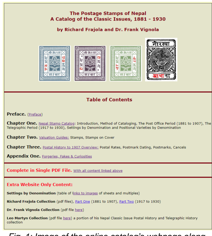
Fig. 1: Image of the online catalog's webpage along with along with a listing of the catalog's content. Also available on the website are pdf files showing some of the classic material.