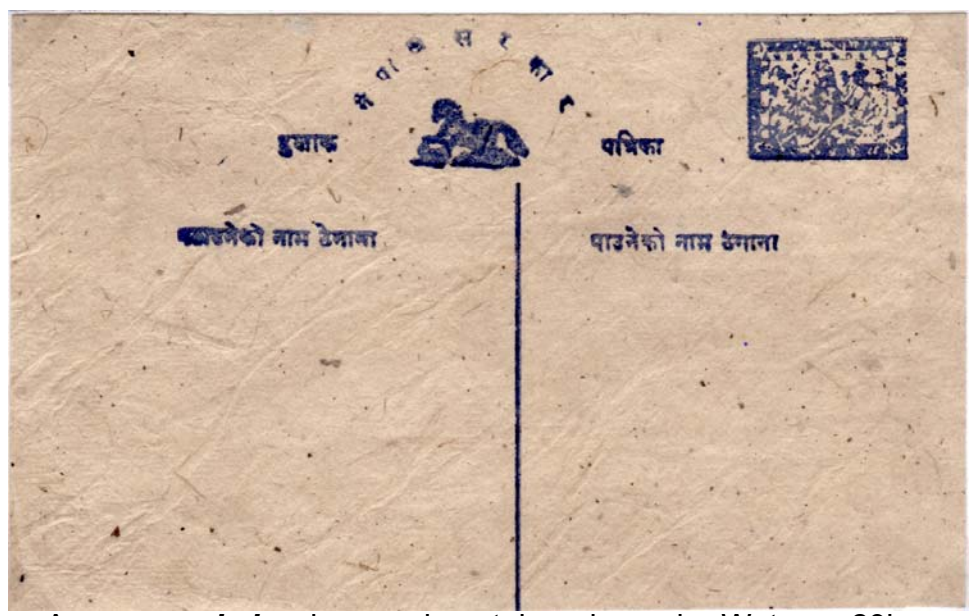
An unrecorded and unused postal card van der Wateren 29b The word Patrika at the right of the horse is almost in line with the lower large text. The center line is shifted to the right side of the horse.

The second postal card is a used copy of van der Wateren's 23 subtype b. It was sent from Amlekganj to Kathmandu in October 1931.