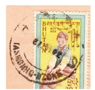
Thimphu GPO 1972

also the main monastic body. It is known as "The Fortress (dzong) of the Glorious Religion".