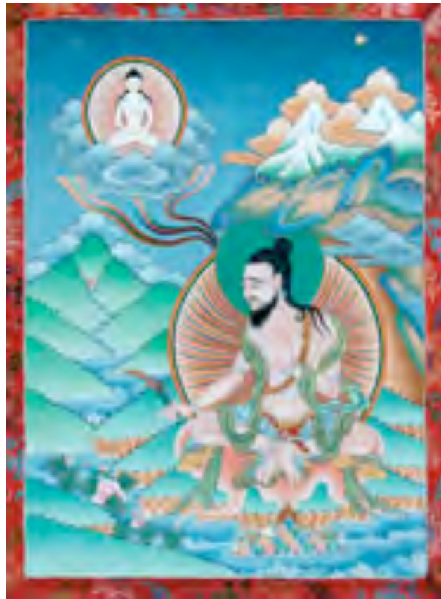
Figure 2 : Gyer spungs chen po sNang bzher lod po in the moment of achieving the supreme realization after which he spontaneously composed the prayer to Ta pi hri tsa.

[all] other sentient beings, who are still caught up in their ignorance, remain behind in samsara. However, we have not abandoned them. Because we are now fully and permanently in the Natural State, the virtuous quality of the great compassion for all sentient beings, which is inherent in it, manifests spontaneously and without limitations. This compassion is total, the great compassion, because it is extended to all sentient beings impartially. And by virtue of the power of this spontaneous compassion, we reappear to Samsaric beings as a Body of Light in order to teach them and help guide them along the path to liberation and enlightenment. 86