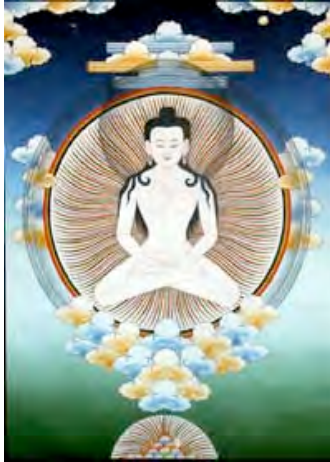
Figure 1 : Ta pi hri tsa .