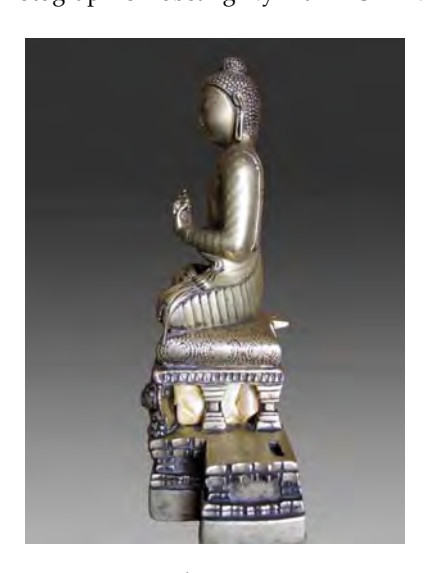
Figure 4 Buddha from Dangkhar. 8<sup>th</sup> century, Gilgit. Bronze with silver and copper inlay, 26 cm high. Side view.