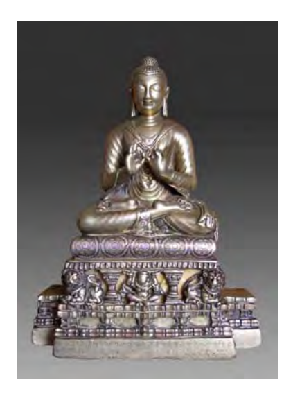
Figure 1 Buddha from Dangkhar. 8<sup>th</sup> century, Gilgit. Bronze with silver and copper inlay, 26 cm high. Front view. Photo: L.N. Laurent, 2010. Retouching: M. Lindén, 2012. Photograph © Lobsang Nyima LAURENT