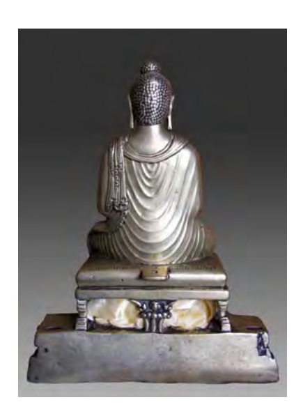
Figure 3 Buddha from Dangkhar. 8<sup>th</sup> century, Gilgit. Bronze with silver and copper inlay, 26 cm high. Back view. Photo: L.N. Laurent, 2010. Retouching: M. Lindén, 2012. Photograph © Lobsang Nyima LAURENT