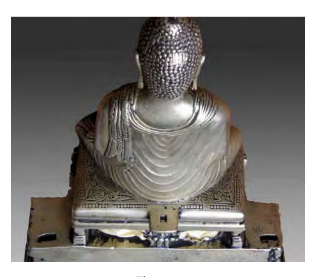
Figure 2 Buddha from Dangkhar. 8<sup>th</sup> century, Gilgit. Bronze with silver and copper inlay, 26 cm high. Top view. Photo: L.N. Laurent, 2010. Retouching: M. Lindén, 2012. Photograph © Lobsang Nyima LAURENT