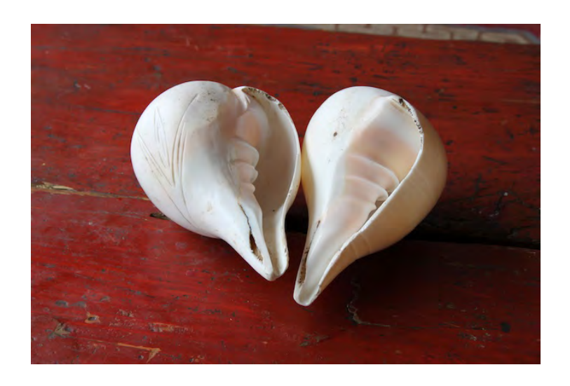
Photo (5) The white conch-shells held by the 'cham dancer at Ting kya monastery.