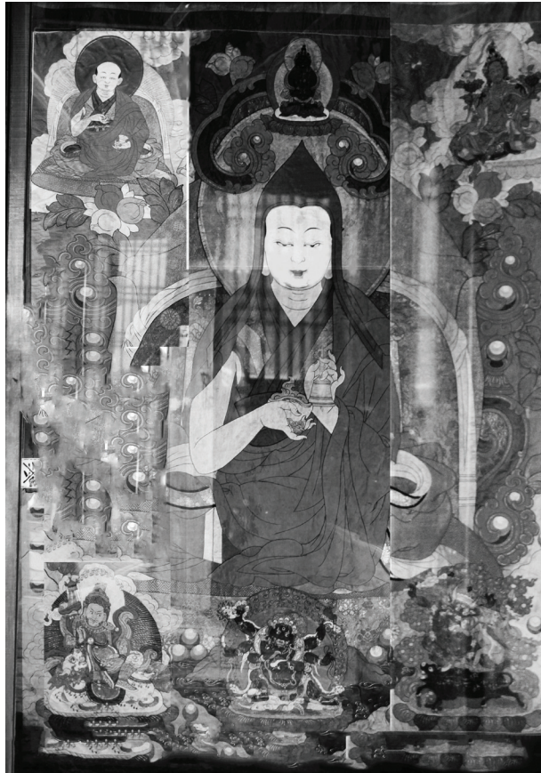
Appliqué thang-ka of Grags-pa-rgyal-mtshan at Erdeni-zuu. Undated, but perhaps 19 th century.

none other than the Gzims-khang-gong-ma sprul-sku referred to above and the focal point of much acrimony in contemporary Tibetan Buddhism; for it was this figure who, following his suicide (1654), which was presumed to have been an outcome of his rivalry with the Fifth Dalai Lama, would later reemerge as the contentious spirit Rdo-rje-shugs-Idan. 3