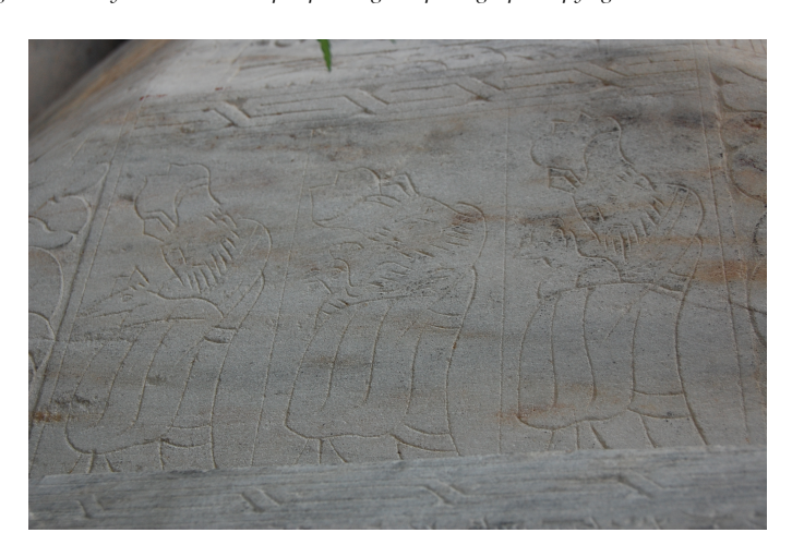
fig. 2. Lun Boyan's entombed epitaph - Detail of the stone cover

The text of the entombed epitaph opens with a reference to the foreign origins of the recipient: "Very far in the extreme West, the steep lands, the spacious territory of mountains [...]" Nevertheless, there is no mention of the events of the Tibetan Empire or of the relationships between the Tang and the Tibetan court. It is also interesting to note that the author evokes the western lands in very general terms