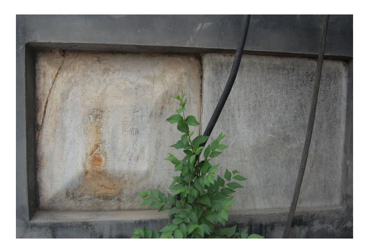
fig. 1. Lun Boyan's entombed epitaph