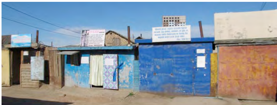
Fig. 3. Diviners' booths at eastern gate of Gandantegchenlin Monastery.