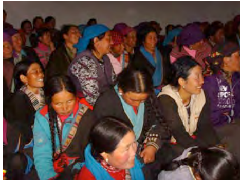
Fig. 2. First evening of the field trip in Xunhua District (Qinghai Province). Photo: Courtesy of Demoness Association, 2011.