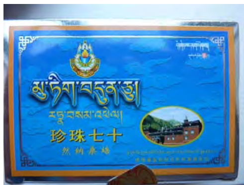
Fig. 5. Mutig 70 precious pill produced at the Derge Tibetan Medicine Hospital in 2014. The small inserted photograph to the right shows the Derge Print House.