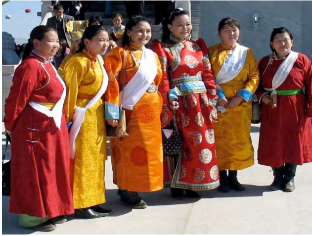
Fig. 2. Khandamaas from Togsbayasgalant.

lay female ritualists as khandamaa , a title which is still in use. Bakula Rinpoche, on his side, advised them to wear white Mongolian caftans ( deel ) with red edges and not the monastic robe used by celibate novice nuns in the Tibetan tradition. Presently, Mongol female lay ritualists wear red, maroon, orange, yellow, or pink deel made from fabrics such as wool, brocade, or cotton according to season and ritual occasion. Many carry a band ( tashuur orkhimj ), often white with red edges, across their chest. Only Mongol novice nuns wear Tibetan style robes.