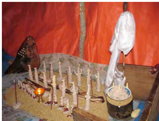
Fig. 1. Lhabse altar with pig's head, tom and offerings.

and doma . 7 The five specialists and Au Wangmo, the sponsor, stayed in the hut for four days. Each day, sessions mainly consisting of the mediums chanting and being possessed by their lha were carried out with different procedures.