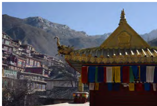
Fig. 2. Lay and monastic residences in Derge, with part of the roof of the Parkhang to the right.