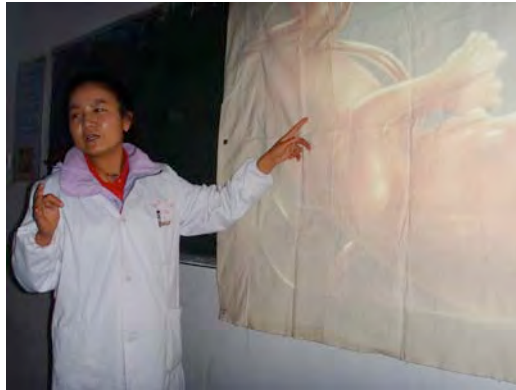
Fig. 3. A Tibetan woman doctor showing a picture of a foetus on a makeshift screen during a field trip, Xunhua District (Qinghai Province).

health. This woman doctor, Palmo added with satisfaction, has given such a talk in front of a total of 10,000 persons, including men: “She is really brave!” 22 In a world where women rarely speak in public (the only public arena where they are conspicuous is the singing scene), a woman speaking about private health problems to men is indeed rare enough, and thus important to mention in this context.