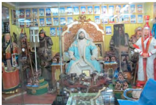
Fig. 4. Chinggis Khan, in the Mongol Aura and Energy Centre.

In Khailaast, another ger suburb north of Ulaanbaatar, we find the Mongol Aura and Energy Centre. In the entrance hall a statue of Chinggis Khan meets the visitor, flanked by four great leaders and 36 great kings of the Mongol Empire, along with Chinggis Khan's consorts.