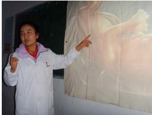
Fig. 3. A Tibetan woman doctor showing a picture of a foetus on a makeshift screen during a field trip, Xunhua District (Qinghai Province).

health. This woman doctor, Palmo added with satisfaction, has given such a talk in front of a total of 10,000 persons, including men: “She is really brave!” 22 In a world where women rarely speak in public (the only public arena where they are conspicuous is the singing scene), a woman speaking about private health problems to men is indeed rare enough, and thus important to mention in this context.