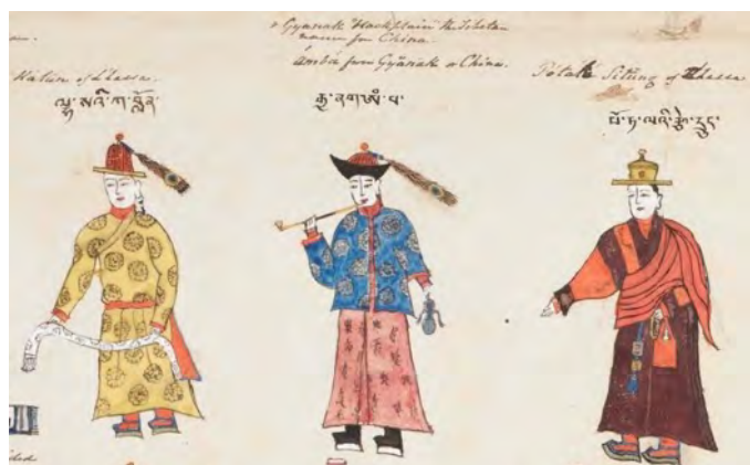
Illustrations of (from left) a Lhasa kalön; an amban; and a Potala tse drung. Extract of Add. Or. 3033 © British Library Board.

The maps of Ü and Tsang are dominated by illustrations of Tibetan monasteries; Tibetan administrative centres or dzongs ( rdzong ); 26 and the aforementioned “Qing posts” and garrisons. These three together constituted the “main seats of power” in 19th century Tibet. Manchu garrison headquarters and parade grounds for soldiers are shown at Lhasa, Gyantsé (Rgyal rtse), Shigatsé (Gzhis ka rtse) and Dingri (Ding ri).