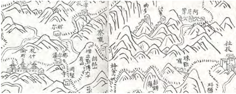
Chalong, Chuduo, Jiangong, and Anigong on Song Yun's map (map oriented to the south, from Huang Peiqiao 1894: 58 and 59), Tashilhunpo and Lhatse are shown on the edge of the map.

On the Wise Collection map, Lhatse Dzong is shown on a massive rock. This place was described by Das as “the chief place of trade in Upper Tsang”. 83 The nearby monastery Lhatse Chödé (Lha rtse chos de), the Lhatse ferry station, and a Qing post are also shown in detail (No. 243).