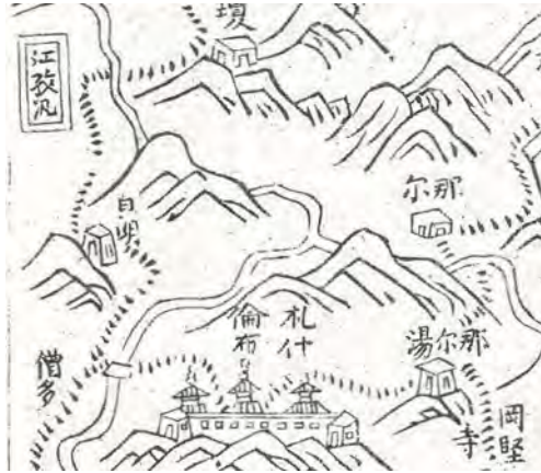
Gyantse on Song Yun's map (map oriented to the south, from Huang Peiqiao 1894: 59), Tashilhunpo is shown on lower edge of the map.

Tsechen (Rtse chen) Monastery 74 —a former important political and religious centre—is shown in the west of Gyantsé located on a mountain slope (No. 186), close to another “Qing post” (No. 187).