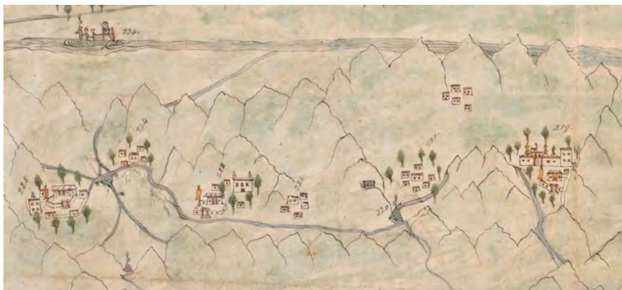
Three Qing posts depicted west of Shigatsé. Extract of Add. Or. 3016 f2

The map depicts three travel routes leading from Shigatsé westwards towards Lhatse (Lha rtse). The main route goes from Shigatsé directly through the mountains to Phüntsoling (Phun tshogs gling) Monastery, passing several monasteries and “Qing posts” (Nos. 219, 223 and 225) as well as settlements, a mountain pass, and a bridge. Although none of them have been identified with certainty, they probably correspond to the places described by Rockhill as “Tibetan military stations of Ch’alung, and Ch’üdo, Chiang gong and Ami gong, at which last three are barriers”. 81