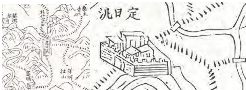
Representation of Dingri on Song Yun's maps (map oriented to the south, from Huang Peiqiao 1894: 51 and 54).

According to the description in Rockhill's publication, Dingri was an important reference point among the other frontier posts in the border area: