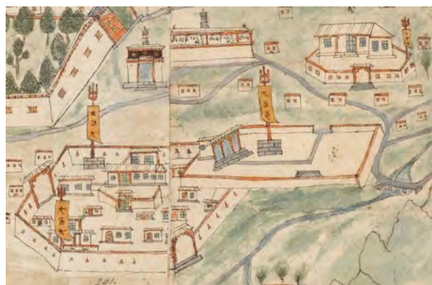
Garrison, exercising ground and yamen in Shigatsé. Extract of Add. Or. 3016 f2