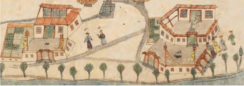
The yamen south of the Potala. Extract of Add. Or. 3013 f1 © British Library Board.

area a “Chinese vegetable garden”, a “Chinese residency of the Ambans”, pig sties, a Chinese restaurant and theatre, and several “barracks of Chinese troops”. 32