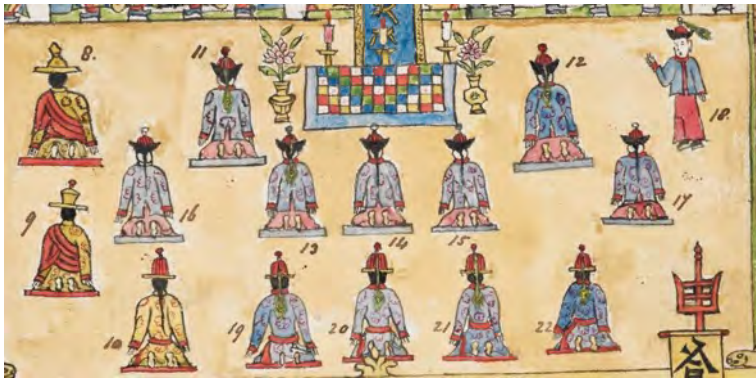
The group of people prostrating in front of the statues. Extract of Add. Or. 3027