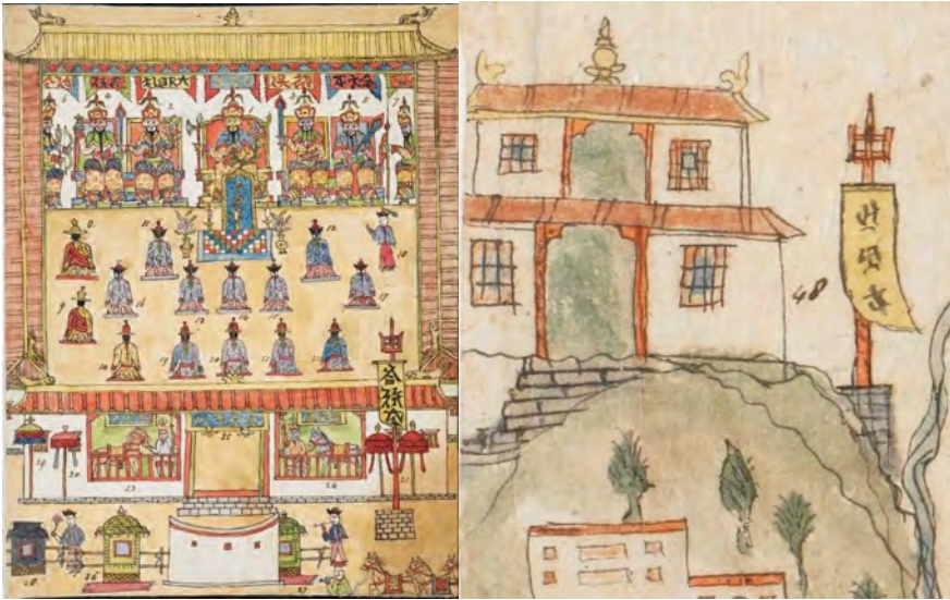
The "Chinese Temple" or Gesar Lhakhang as a) detailed additional drawing and b) extract from the Lhasa map. Add. Or. 3013 f1 and 3027 ©British Library Board.

Among the Wise Collection's accompanying drawings there is also a very detailed illustration and description of the Gesar Lhakhang or "Chinese temple". It was built in "Chinese style" in 1792 on behalf of the Qianlong Emperor (乾隆, r. 1735–1796). The temple was intended to commemorate the Gorkha War victory (1792) and dedicated to the Chinese god of war—Guandi (關帝)—who, it seems, was identified with the legendary King Gesar for political reasons. 40