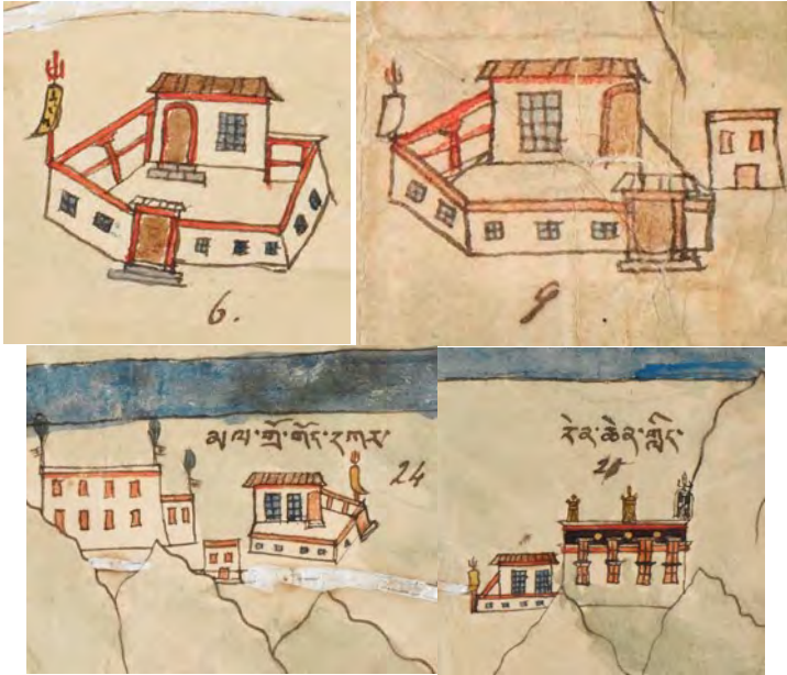
The “Qing” residences in the Kyichu Valley east of Lhasa: located next to Tsel Gungtang (No. 6, Tshal gung thang), Dechen Dzong (No. 9, Bde chen), Meldro Gongkar (No. 24) and Rinchen Ling (No. 25, Ren chen gling), from left to right. Extract of Add. Or. 3017 f1 and f2 © British Library Board.

In Tsetang we find a “Chinese temple” (No. 66 on the map and labelled “ gya lha khang ” in the notes), shown in a similar style as the residences, but with the typical roof decoration of temples and monasteries. This likely represents another Guandi/Gesar temple. 64 On the other hand, it could also represent a mosque of Chinese Muslims. There exist several historical reports about Muslims and a mosque in Tsetang. 65