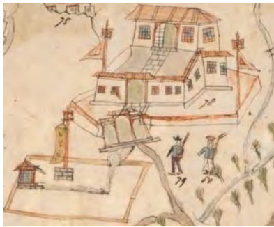
Trapchi/ Drazhi. Extract of Add. Or. 3013 f2 © British Library Board.