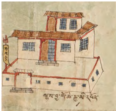
The house of the Lhasa jargochi gyami pön. Extract of Add. Or. 3017 f1, © British Library Board.

monasteries indicates that his role was significant. Sarat Chandra Das also mentioned in his “list of the important places of Lhasa” a place called “Cha ko-chhe” 63 —probably referring the same building.