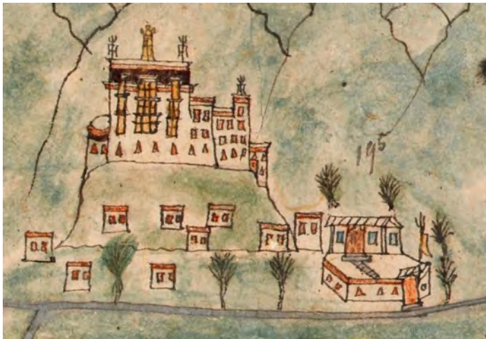
Penam Dzong and the nearby “Qing post” in detail. Extract of Add. Or. 3016 f2 © British Library Board.

The large building on top of the hill east of Shigatsé (No. 195) probably represents Penam Dzong (Pa snam rdzong), described by Das as the “fort of Panam, situated on a hillock”. 77 The “Qing post” depicted on the foot of the hill is probably another circuit house. Rockhill mentioned two military posts to the east and southeast of Tashilhunpo: “Ninety li to the E. of Trashil’unpo is the military post of Polang [Bailang (白朗) on Song Yun’s map]. 78 Going thence S.E., one enters the mountains, and passing the military post of Tui-chu’iung [Duiqiong (堆瓊) on Song Yun’s map] 79 ”. 80