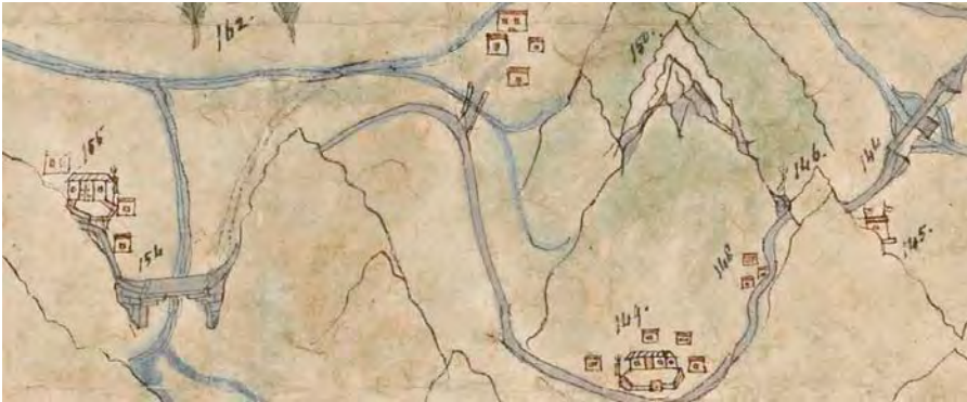
The two residences between Yamdrokto and Gyantsé. Extract of Add. Or. 3016 f3.

There are two more “Qing posts” shown between the Yamdrokto Lake and Gyantsé. One (No. 149) is located on the foot of the mountain pass Kharo La (No. 146) below the Nöchin Kangsang (Gnod sbyins gang bzang, No. 150). This post was also mentioned by Das who again (as in Chushul) described it as a “Gya-Khang, or the Ampa’s circuit house, which is situated on the flat of Dsara”. 68 The other post (No. 155) is shown next to a river and a bridge. It probably represents a border crossing point in that area.