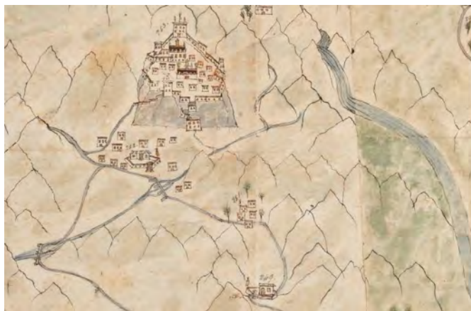
Shelkar Dzong, with Qing posts depicted below the dzong, and close to the Gyatso La. Extract of Add. Or. 3016 f1 ©British Library Board.

A further “Qing post” (No. 252) is depicted surrounded by houses below Shelkar Dzong (Zhal dkar rdzong) probably representing Shelkhar shöl . Rockhill mentioned that “N. of Tingri two stages one comes to the military post of Shék’ar”. 86 From Lhatse the road to Shelkhar (Zhal dkar) goes past another Qing post—probably another circuit house (No. 249). Next to the building we find a little Tibetan caption: brgya tsho la (Gyatso La, the name of a mountain pass) which is the only caption written directly on the map of Tsang. This Gyatso La was an important pass in the border area between Tibet and Nepal, and was also mentioned in Rockhill’s publication: “Two stages N. of Shék’ar one comes to the great Kia-ts’o mountain, on which is the military post of Lolo t’ang (or station)”. 87 On Song Yun’s map it is referred to as the Jiacuo (甲鏗) mountain.