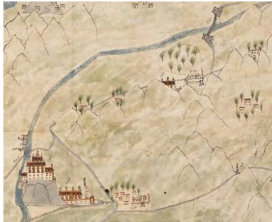
Phüntsoling and Lhatse Dzong and the nearby Qing posts. Extract of Add. Or. 3016 f1 © British Library Board.

On the Wise Collection map, Lhatse Dzong is shown on a massive rock. This place was described by Das as “the chief place of trade in Upper Tsang”. 83 The nearby monastery Lhatse Chödé (Lha rtse chos de), the Lhatse ferry station, and a Qing post are also shown in detail (No. 243).