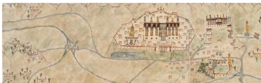
The garrison and parade ground at Gyantsé and the Tsechen Monastery. Extract of Add. Or. 3016 f3 © British Library Board.

The “high road between Lhasa and Gyantse” 69 leads of course to Gyantsé which is shown in great detail, dominated by an illustration of Pelkhor Chödé Monastery (Dpal 'khor chos sde, No. 177), Gyantsé Dzong (No. 156), a garrison (No. 157) and the nearby parade ground (No. 158). Tsybikov stated that the quarters of the garrison soldiers who gathered here for reviews at various intervals, were situated at the southern foot of the rock 70 —as displayed on the map. Nain Singh, who conducted his route survey between Nepal and Lhasa in 1865/1866, mentioned that “a force, consisting of 50 Chinese and 200 Bhotia soldiers, is quartered here”. 71 Rockhill stated that “at Gyantsé is a captain with a garrison of Chinese and Tibetan troops. The two posts of Tingri and Gyantsé are under the orders of the Assistant Amban resident at Shigatsé”. 72