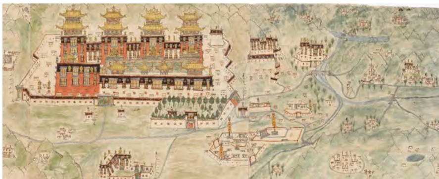
Shigatsé town and surroundings. Extract of Add. Or. 3016 f2 © British Library Board.

about half a mile square, called jah-hu-tang , or in Chinese ta-thag [...]. To it is attached a walled enclosure, in the centre of which is a large house used by the Ampa for target shooting with arrows and bullets. 75