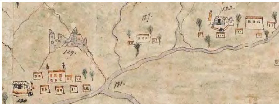
Two “Qing posts” on the Kyichu River between Lhasa and Chushul. Extract of Add. Or. 3016 f3

There are two further “Qing posts” shown on the route between Lhasa and Chushul (Chu shul). One is depicted with trees and nearby houses (No. 123), probably corresponding to the village of “Nam” mentioned in Das’ narrative as including a “Gya-khang or the Ampa’s circuit house, the nearest stage to Lhasa”. 66 The other (No. 130) is shown at Chushul itself, at the foot of a mountain with ruins on top. Chushul was an important stop on the way to Lhasa coming from south and thus it is to be expected that it would contain a circuit house.