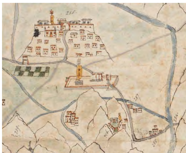
The garrison and exercise ground at Dingri. Extract of Add. Or. 3016 f1

Dingri is the only frontier post shown on the maps in the Wise Collection.