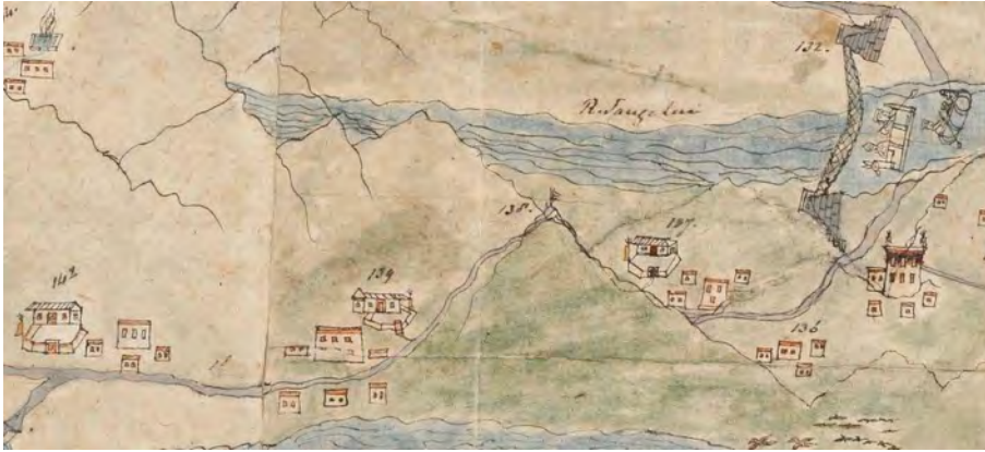
The three residences between Chakzam ferry and on the shore of the Yamdrokto. Extract of Add. Or. 3016 f3

There are two more “Qing posts” shown between the Yamdrokto Lake and Gyantsé. One (No. 149) is located on the foot of the mountain pass Kharo La (No. 146) below the Nöchin Kangsang (Gnod sbyins gang bzang, No. 150). This post was also mentioned by Das who again (as in Chushul) described it as a “Gya-Khang, or the Ampa’s circuit house, which is situated on the flat of Dsara”. 68 The other post (No. 155) is shown next to a river and a bridge. It probably represents a border crossing point in that area.