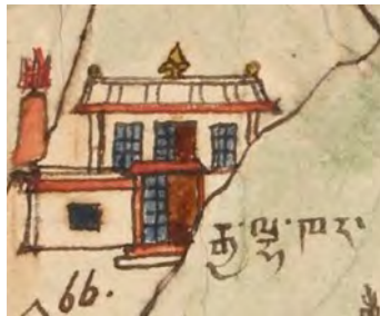
The “Gya Lhakhang” in Tsetang. Extract of Add. Or. 3017 f4

In Tsetang we find a “Chinese temple” (No. 66 on the map and labelled “ gya lha khang ” in the notes), shown in a similar style as the residences, but with the typical roof decoration of temples and monasteries. This likely represents another Guandi/Gesar temple. 64 On the other hand, it could also represent a mosque of Chinese Muslims. There exist several historical reports about Muslims and a mosque in Tsetang. 65