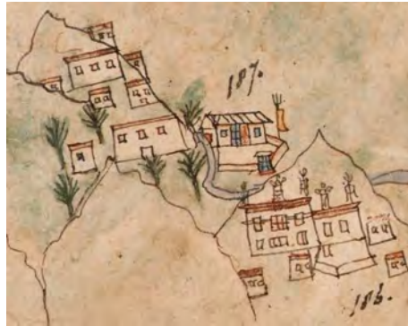
Tsechen Monastery and the nearby “Qing post” in detail. Extract of Add. Or. 3016 f3

Tsechen (Rtse chen) Monastery 74 —a former important political and religious centre—is shown in the west of Gyantsé located on a mountain slope (No. 186), close to another “Qing post” (No. 187).