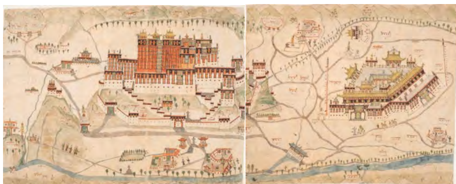
The map of Lhasa showing the yamen of the ambans (below the Potala); the Trapchi/Drazhi military camp (upper part between Potala and Jokhang); Gesar Lhakhang (lower left corner); and another building in “Chinese style” (lower right corner). Add. Or. 3013 f1 and f2 ©British Library Board.

The map of Lhasa is the most detailed and largest city map in the Wise Collection. It is clearly dominated by illustrations of the town's two most significant buildings—the Potala (Po ta la) Palace and the Jokhang (Jo khang) temple or Lhasa Tsuglakhang (Lha sa gtsug lag khang). 30 As Tibet's capital, Lhasa was also the general headquarters for representatives of the Qing in Tibet, the ambans , and thus the map includes detailed depictions of the yamen of the ambans , as well as of the Trapchi ( grwa bzhi ) military camp and parade ground; the “Chinese Temple” or Gesar Lhakhang (Ge sar lha khang) on the summit of the Barmari (Bar ma ri) hill; 31 and another building in “Chinese style” (probably one of the mosques of the Chinese Muslims).