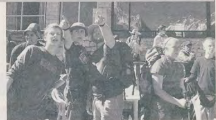
Nepal Tourism Year 2011 21