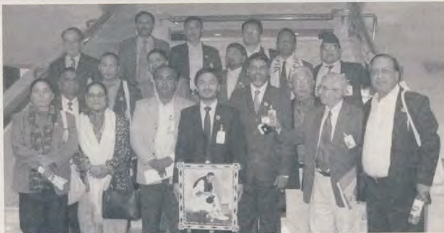
Nepalese Delegation In Ethiopia