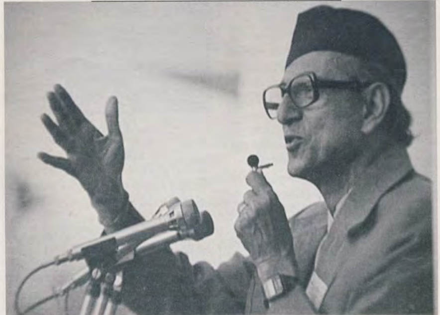
COMMENTARY Reconciliation Not Consensus

Vol.: 04 No.-14 Jan.07-2011 (Poush 23,2067)