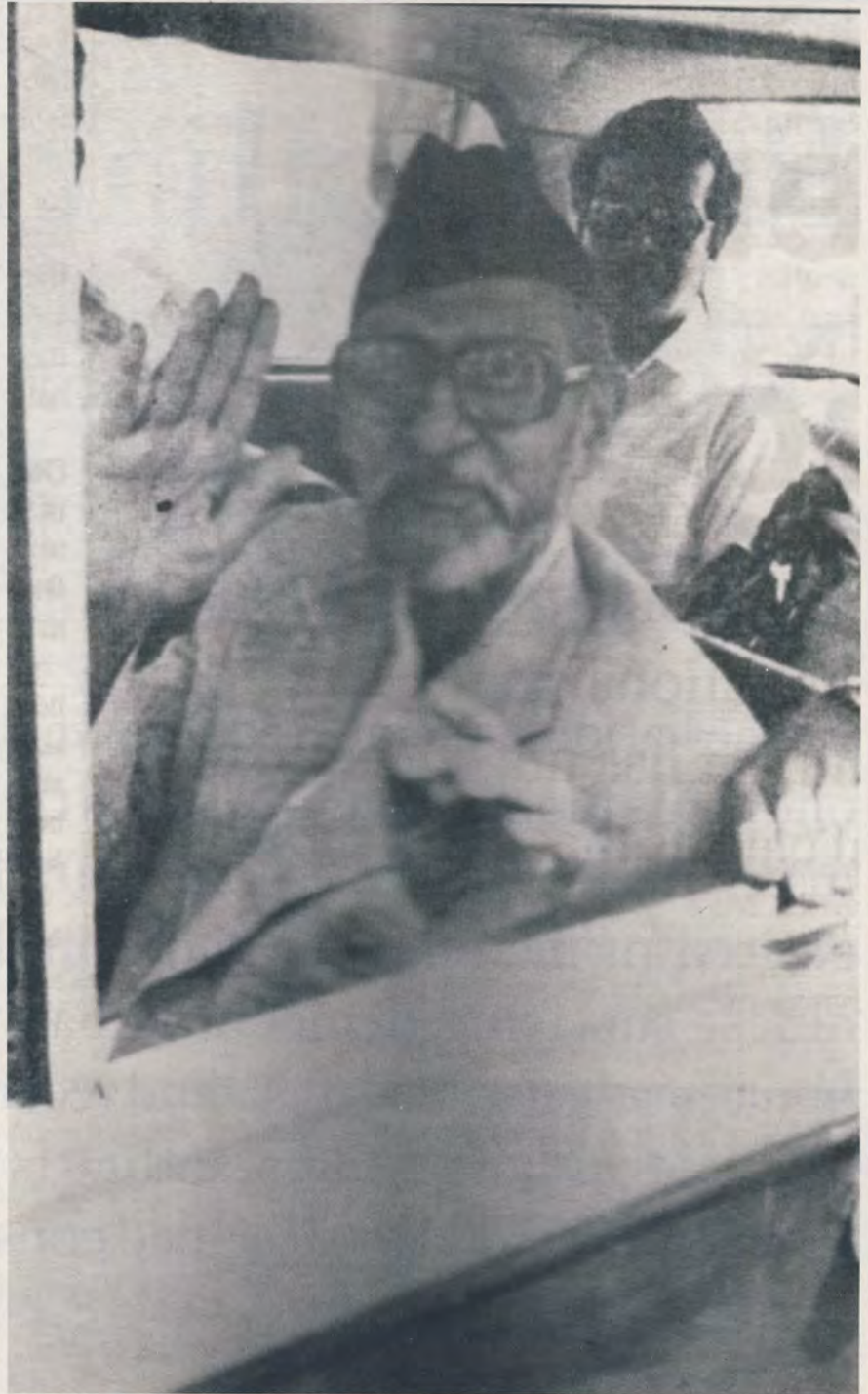
The late BP Koirala with Ganesh Raj Sharma

Nepal today is not Nepal of yesterday either. Much water has flowed down Koshi, Gandaki and Karnali. There has been a regime change. The monarchy is no more. A republican set-up is in place. A federal structure is due to replace the long-running unitary state. A constituent assembly is in place with the newly empowered people exercising