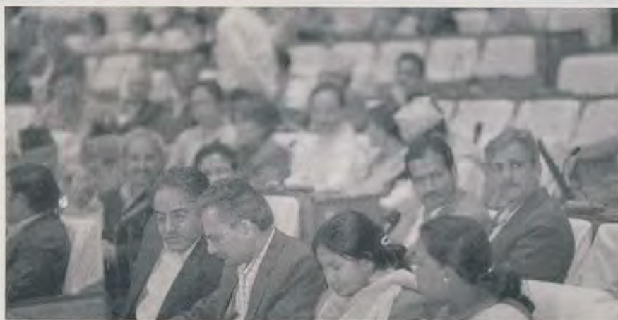
The Legislative Parliament: No early breakthrough likely in the winter session

Why would these two very different political cultures have such a similar negative policy towards community empowerment? To the Kangressi leader, who was a shop-owner down below on the Prithvi Highway, community electricity undermined his 'vote for me, I'll get you electricity' patronage dispensing politics. For the Maoist, a village-level electricity cooperative or association would mean the emergence of a strong organizing principle in the village outside of his party's control. Community empowerment would mean their effective disempowerment, hence their need to prolong the current state of unaccountable impunity. This is why there is no seriousness in constitution framing or curtailing bad public behaviour by their cliques and clans. ■