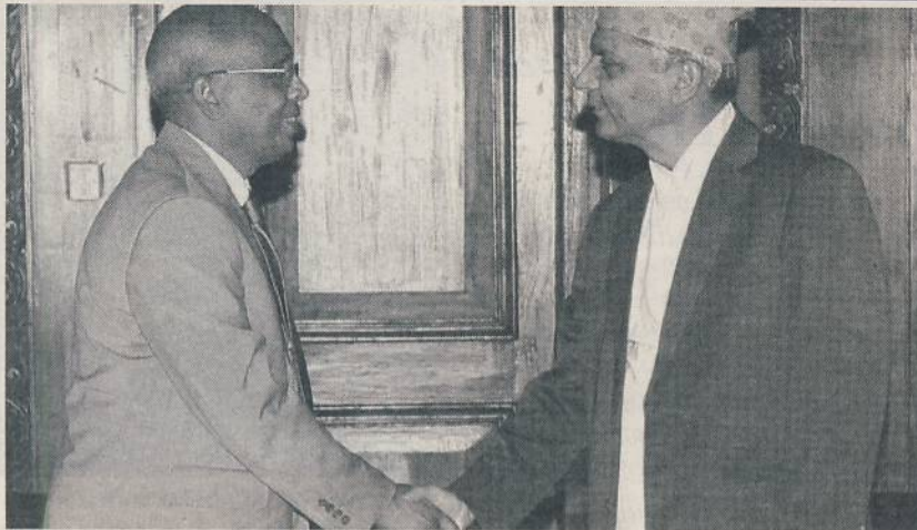
SAARC General-Secretary Ahmed Saleem (Left) meeting chairman of council of Minister Khilraj Regmi