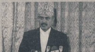
Finance Minister Shanker Koirala