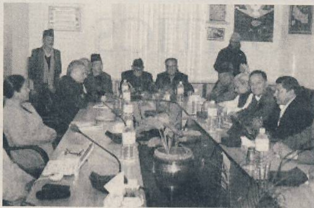
Leaders of Three Political Parties

Making things more complex, UCPN-Maoist has forwarded five points as their demand to join CA. The demands include Constitution of High Level Probe Commission, Amendment