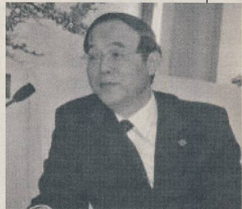
Chinese Leader Ai Ping

The message of Ai Ping was loud and clear: get involved in the