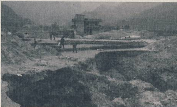
Sinkholes in Pokhara

Looking at the geological vulnerability of Pokhara, Practical Action Nepal has been supporting the Sub-Municipality in strengthening its capacity to strictly implement the building code before any such havoc happens. The program implemented by